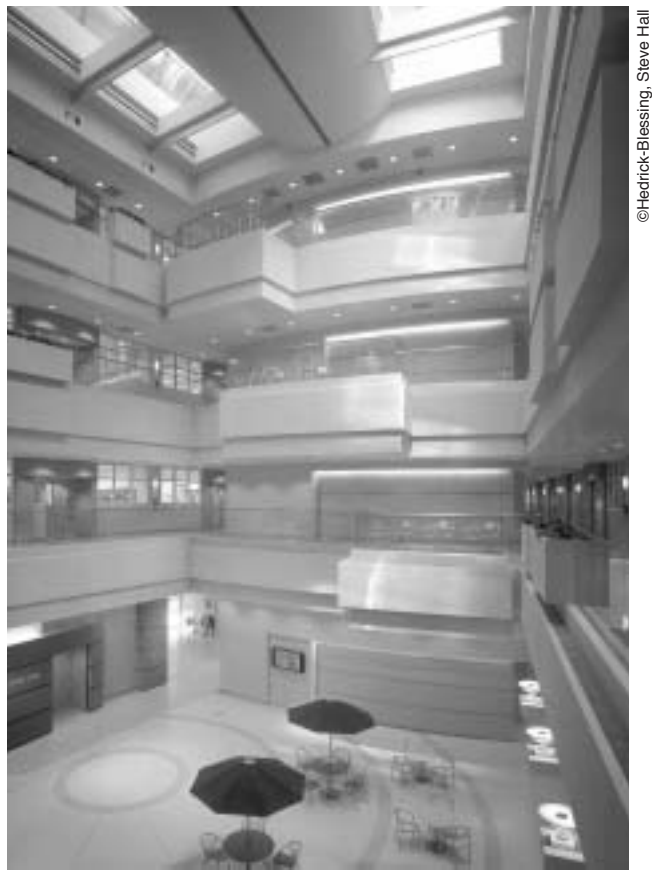
Figure 4. Skylit atria bring natural light into the building's four floors.

consumption by reducing the need for supplementary artificial lighting, and sensors shut off the artificial lights when work areas are not in use. The natural lighting also helps to enhance the comfort levels and productivity of employees.