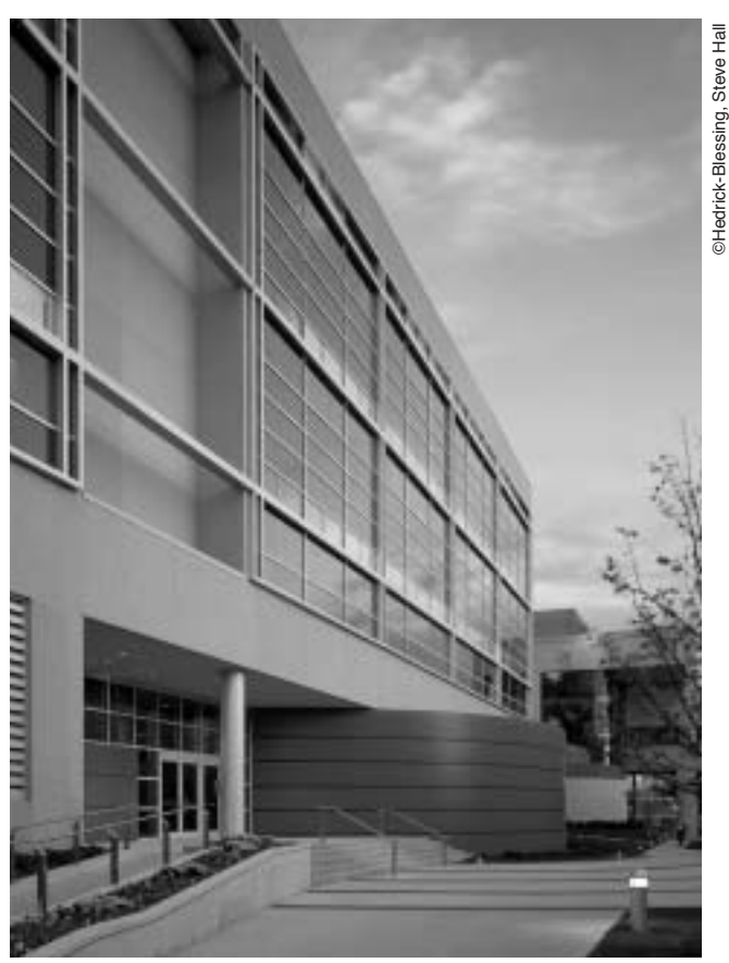
Figure 3. The perimeter windows contain low-E glazing, as do the special skylights.

The distance from the exterior wall of the building to the atria is 44 ft. Some laboratory areas are not separated from work stations on the perimeter. Where separation is necessary, glazed partitions provide an invisible physical barrier. Inside the building, windows between the labs and the atria allow natural light to penetrate the entire facility. These allow views to the outside from any point in the building. The use of natural light cuts energy