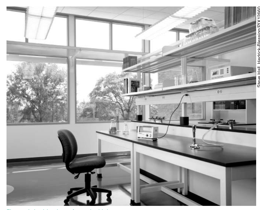
Figure 4. Inside view of a typical laboratory

80% of the general exhaust without the potential hazards associated with actual recirculation. The use of 100% outside air in the offices results in a quantity of ventilation air greater than that required by ASHRAE standard 62-89. Labs have the 100% outside air required for safety. The diagram in Figure 5 depicts the integrated system.