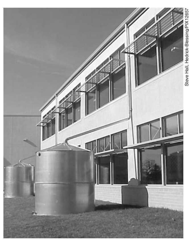
Figure 3. Exterior view of the Nidus Center shows the cisterns that store rainwater for irrigation and the exterior overhangs.

for the labs and a centralized glass wash and autoclave capability.