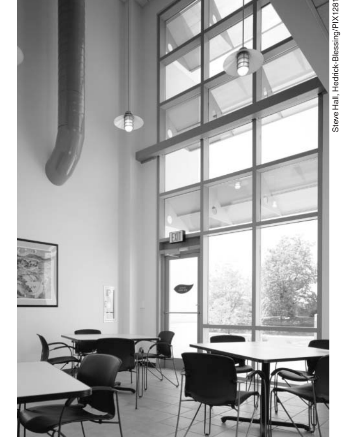
Figure 2. The Nidus Center's break room opens onto an outdoor patio.

Utilities run horizontally in the space above the ceilings on both floors. The main air supply for the building runs above the central hallway. The general exhaust ducts run parallel to the supply air on both sides, in about the middle of the labs. The fume hood exhaust runs parallel in the horizontal ceiling space adjacent to the windows. Boilers, chillers, air handlers, and 8-ft-high heat recovery wheels are all in the building's basement. Industrial hot and cold water, vacuum, natural gas, and potable hot and cold water are piped through the ceiling to each lab bench. There is a central reverse-osmosis deionized water system