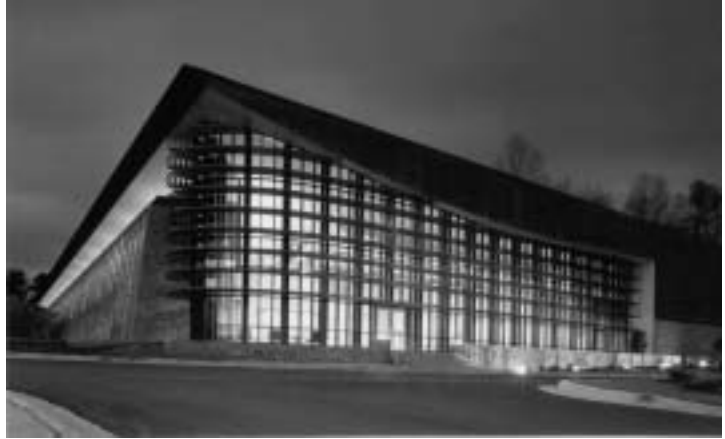
Figure 1. Vertical columns along the west facade of the building make elegant use of granite while providing shade. Also shown is the south-facing two-story lobby with its distinctive sunshade.

The first floor has a double-height, south-facing public lobby with curtain wall glazing and a distinctive sunscreen of horizontal aluminum tubing, coated with