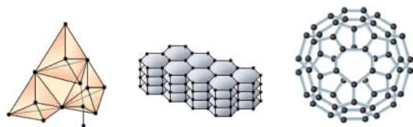
Figure 2. Structures of Diamond, Graphite and Buckminsterfullerene 23

Carbon and some other elements (including sulphur, tin, and oxygen) are found in multiple structural forms, called allotropes, which have significantly different properties. For example, in crystalline form, pure carbon is found as graphite (very soft), diamond (very hard), and various sizes of Buckminsterfullerenes (depending on the number of carbon atoms).