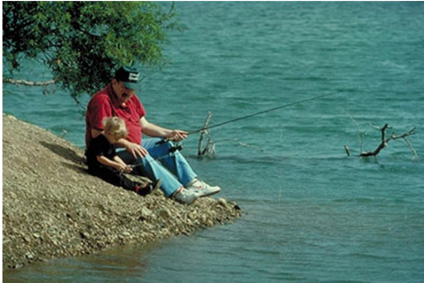
Fishing along Lake Superior

Lake Superior Lakewide Management Plan 2000