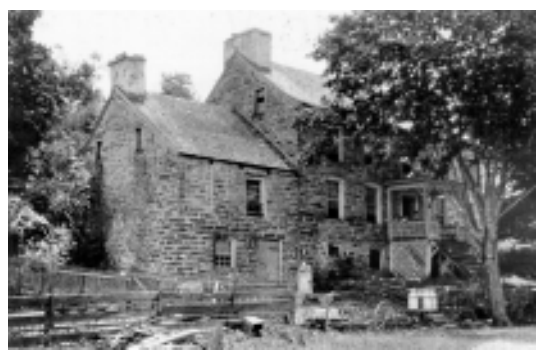
Van Campen Inn around 1900. The north (left) section was built around 1742 and torn down in 1917. The larger right section dates from the 1740s and 1750s. The porch dates from the 1800s.

Military Trail is for hiking only: no bicycles, automobiles, or motorized vehicles of any kind are permitted on the trail. Hunting is NOT permitted along the trail but the park recommends that hikers wear orange for safety.