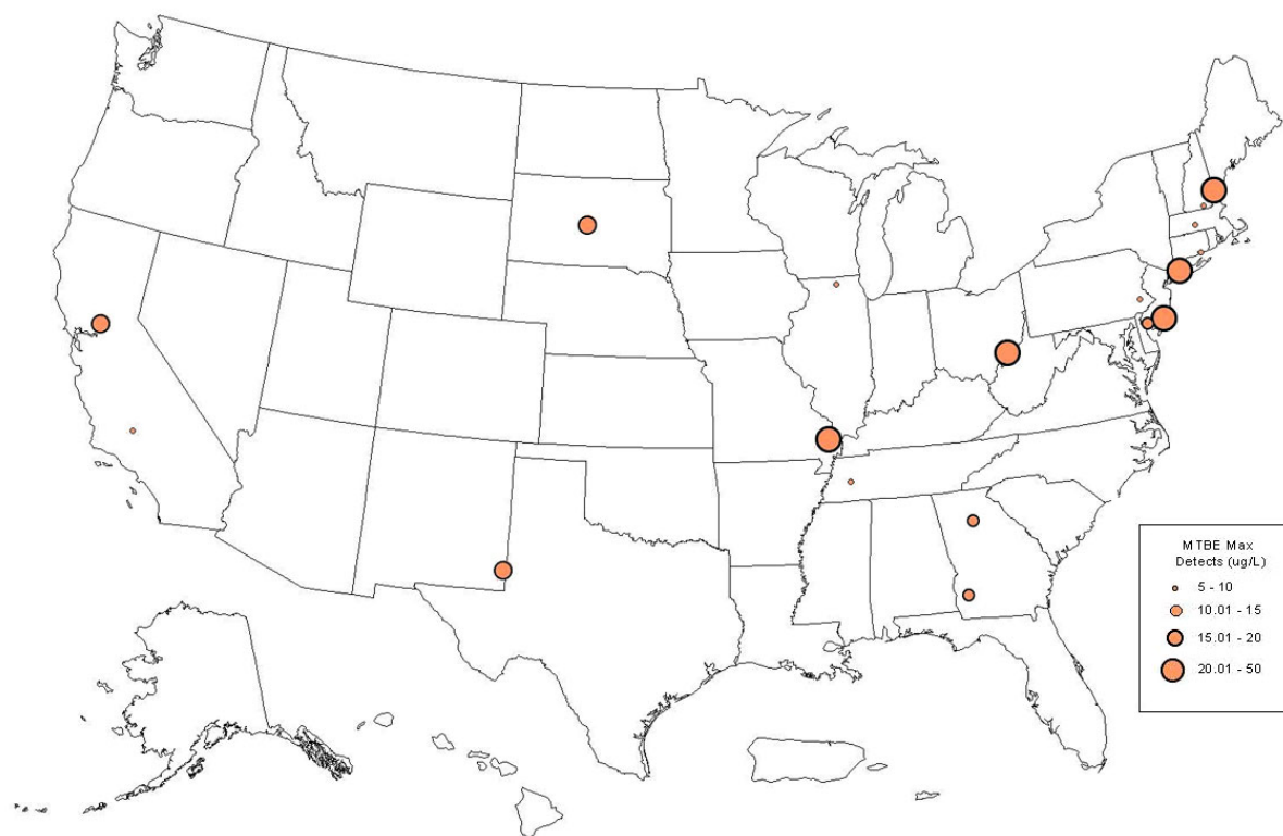
Exhibit 13-13: System-Level Geographic Distribution of MTBE in UCMR 1 Monitoring – Maximum Concentration at Each System with Detections

Compared with some national, regional, state, and local studies summarized in this report, the UCMR 1 occurrence data indicate low MTBE occurrence. When comparing UCMR 1 results to the results of other MTBE occurrence studies, several points should be considered. First, UCMR 1 is a survey of drinking water only. Many studies that report higher rates of MTBE occurrence (for example, USGS NAWQA studies and monitoring connected to UST investigations) are studies of ambient water.