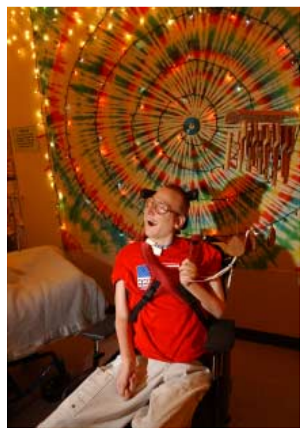
SANDIANS' ECP and LEAP participation help support local agencies such as Adelante Development Center, whose mission is to assist and support people with disabilities in discovering and implementing their personal goals.

this year. Without the tremendous generosity of Sandians, this would not be possible, because they account for the largest proportion of our total donations. Thanks to all of you for the commitment you have made to your community."