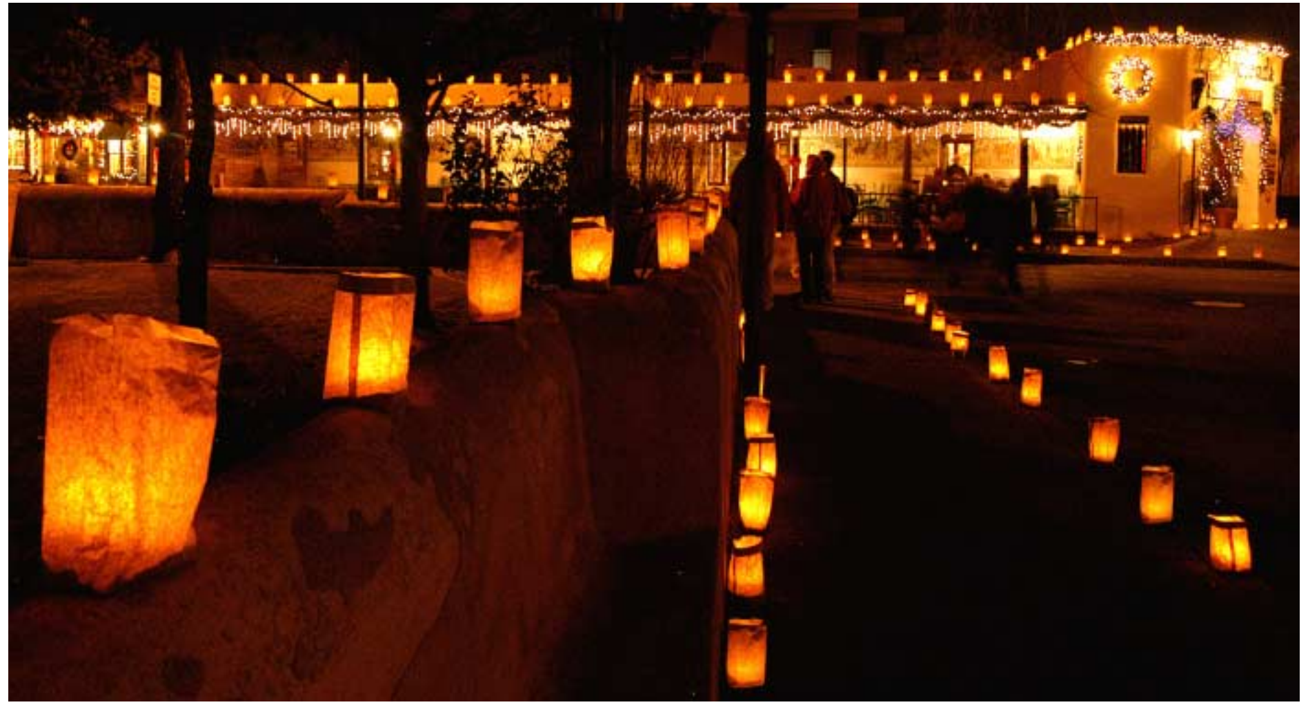
HOLIDAY TRADITION — Luminarias glow softly in Albuquerque's Old Town Plaza, a sure sign that the holiday season has arrived in New Mexico.