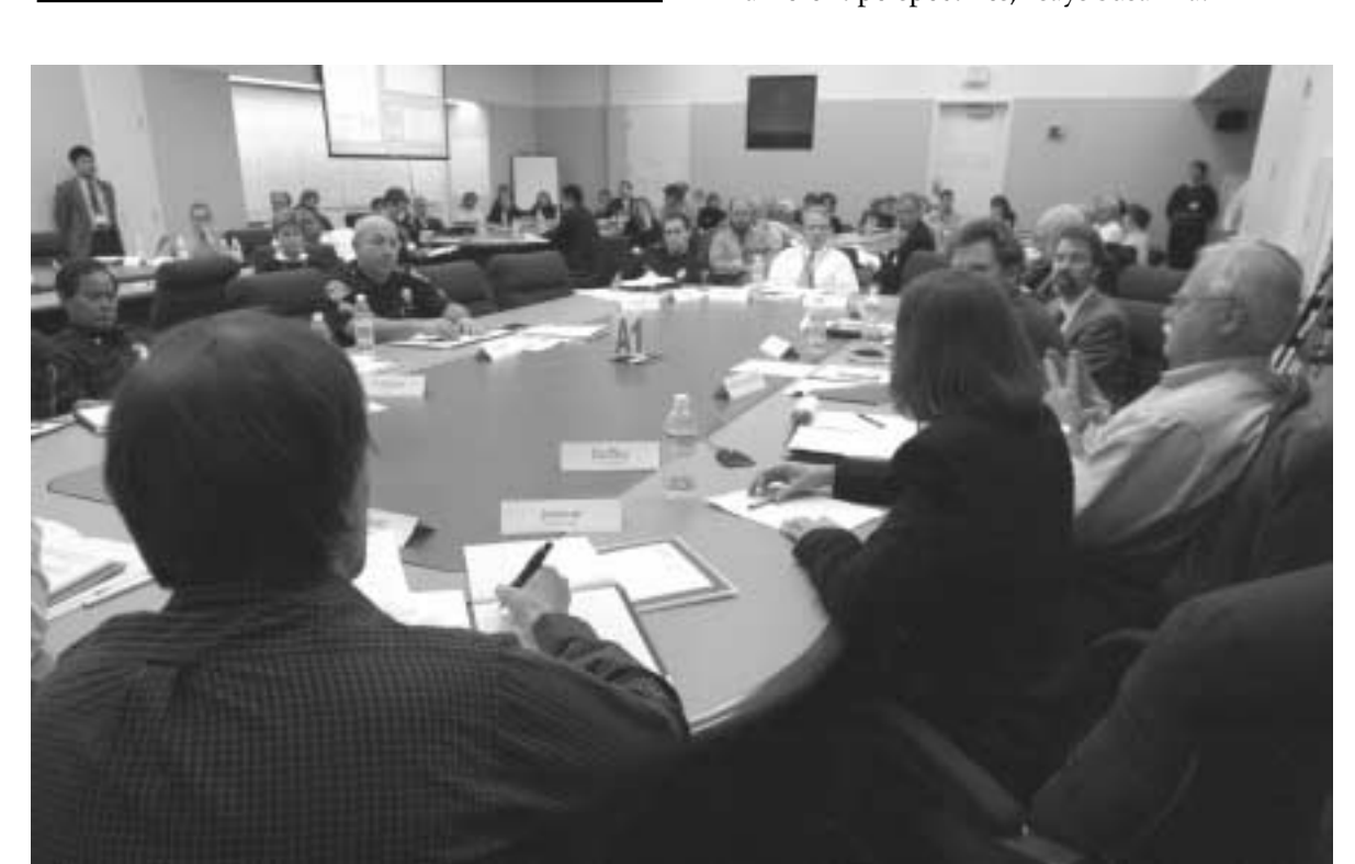
THE TABLE-TOP exercise gathered 60 participants and observers at the emergency operations center for a day.

"Everybody from different organizations has different perspectives," says Susanna.