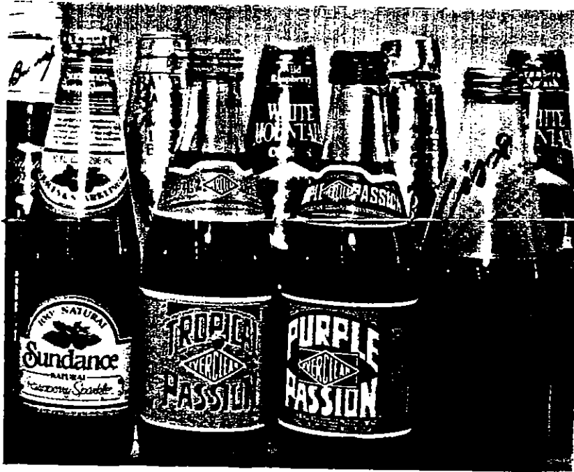
◀ Students were tested on their knowledge of dozens of similar-looking beverages.