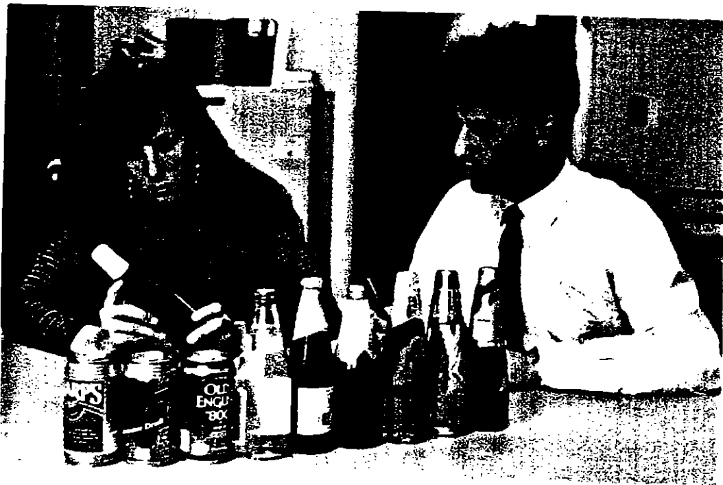
▲ Interviewers displayed bottles and cans and observed students examining the beverages.