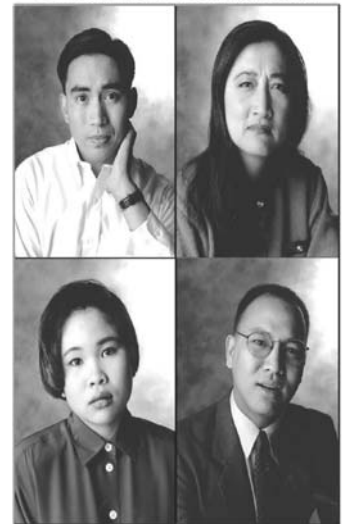
Office of Special Counsel for Immigration Related Unfair Employment Practices U.S. Department of Justice Civil Rights Division

Asylees and refugees are also often subject to citizenship discrimination and unfair documentary practices. For example, they are frequently denied employment because many employers do not recognize their work authorization documents. OSC works with the HHS Office of Refugee Resettlement ("ORR") to create a joint OSC/ORR letter that provides guidance to refugees, asylees and employers regarding proper employment eligibility verification requirements and explains how the OSC can assist in the process.