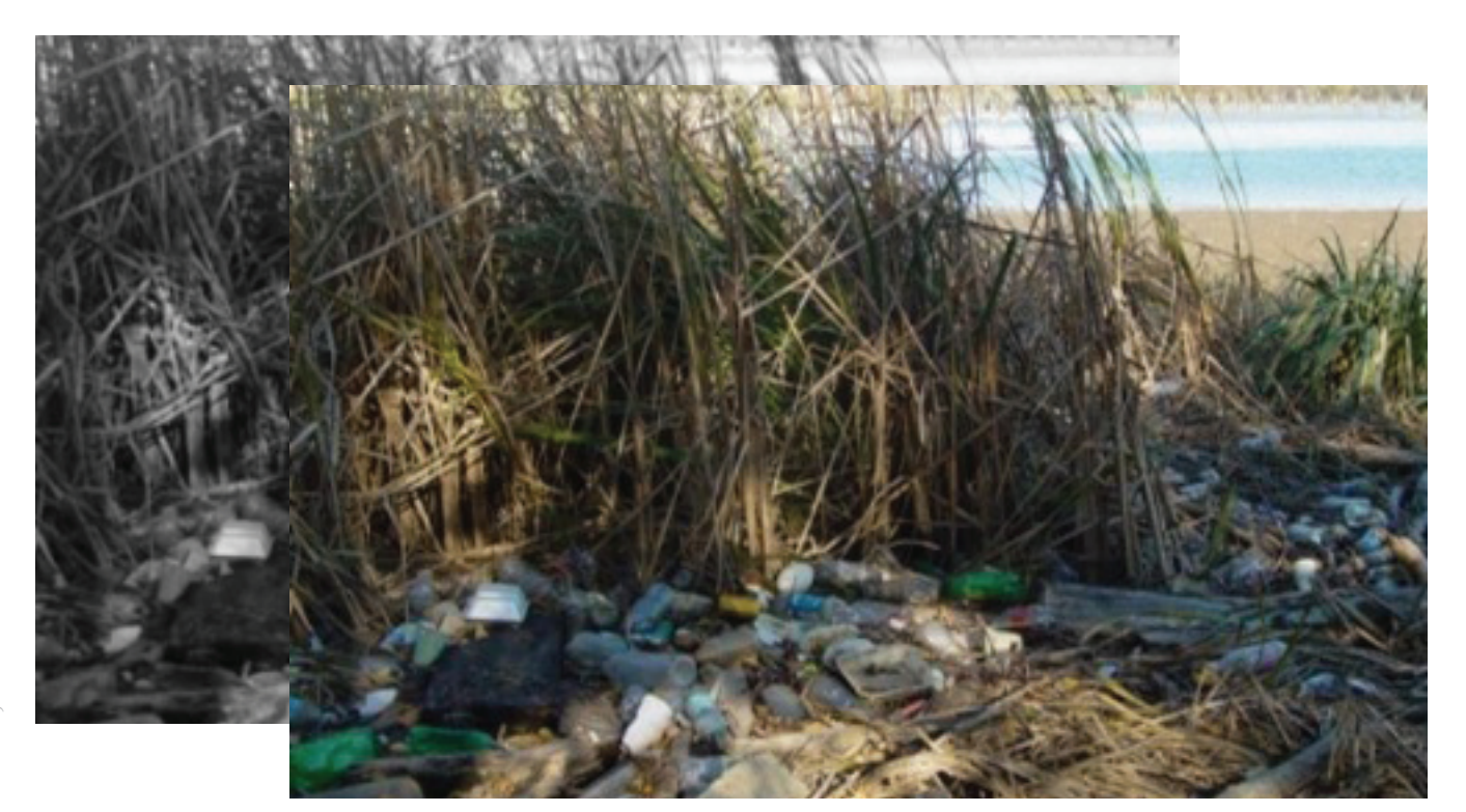
Section 2.0 Introduction