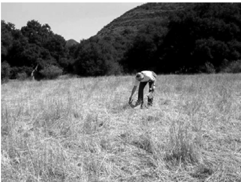
Monitoring a grazing allotment (Los Padres NF).

S53: Salt and Mineral Locations: Salt and/or other supplements will be located greater than 1/4 mile from all water sources including: ponds; riparian areas; meadows; springs; seeps; vernal pools; susceptible threatened, endangered, proposed, candidate and sensitive species and habitats; livestock and wildlife water developments; concentrated and developed recreation areas; and other sensitive areas including sensitive heritage resources, unless approved by the responsible Forest Service officer.