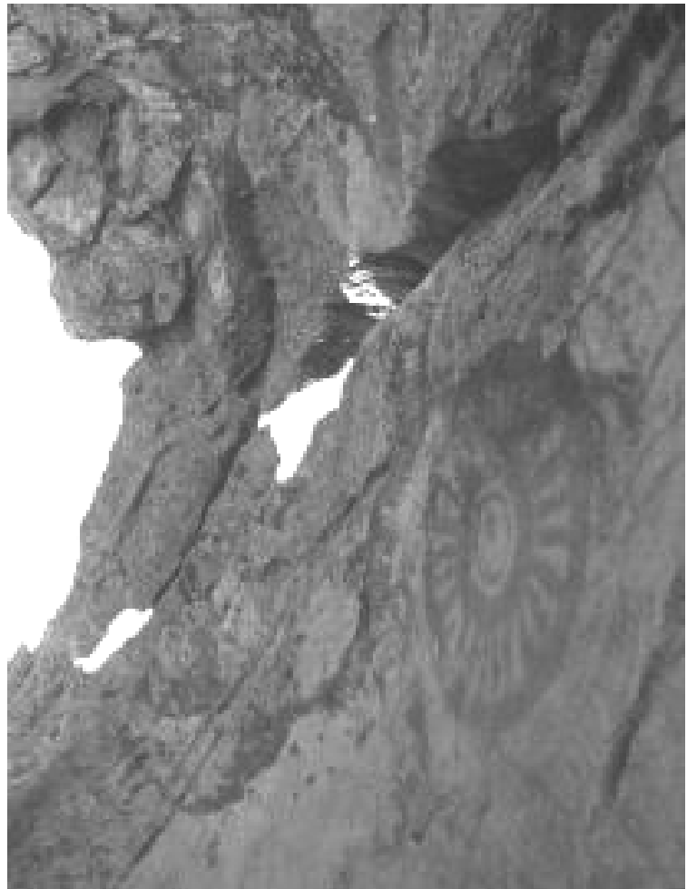
Rock art on the Los Padres NF.

S62: Protect the access to and the use of sensitive traditional tribal use areas.