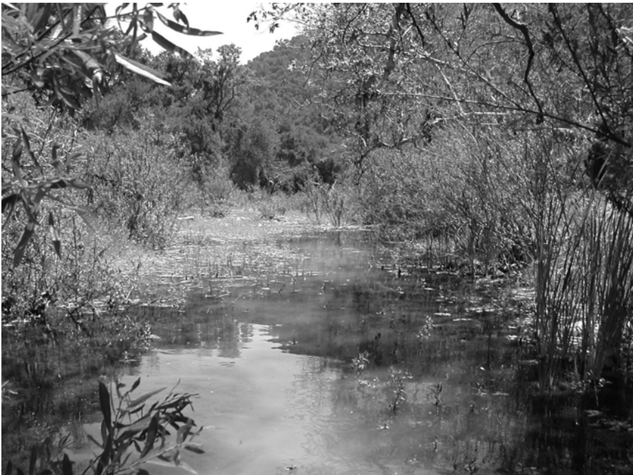
This riparian area is within a grazing allotment (Los Padres NF).