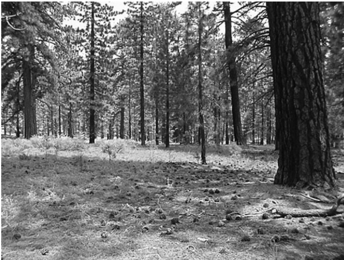
This forest stand has had thinning and slash burning treatments

S3: Maximum Size Openings Created by Timber Harvest (36 CFR 219.27 (d) (2)). Table 3.1: Appropriate Silviculture Systems and Vegetation Treatments by General Forest Type identifies the maximum allowable opening acreage for forest types. This limit shall not apply where harvests are necessary as a result of catastrophic conditions, such as fire, insect and disease attack, windstorm, or drought.