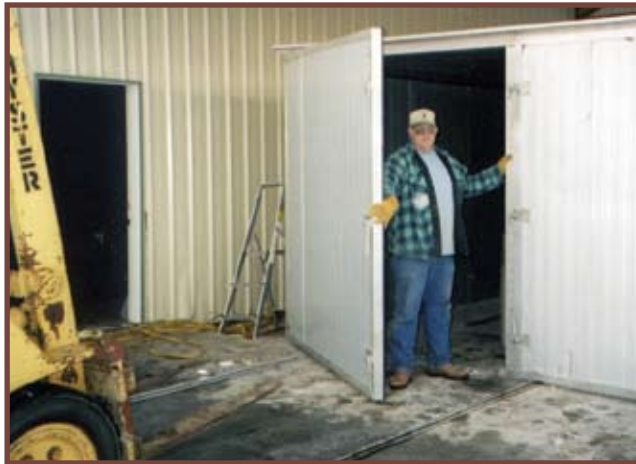
Small-capacity wood dryer in Fossil, Oregon.

helping wood products manufacturers grow and become more profitable by helping them make connections to new markets, locate financing opportunities, take advantage of employee training programs, and find alternate sources of supply.”