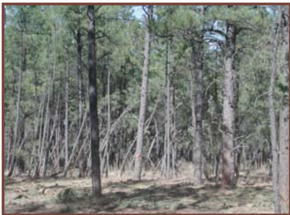
Wildland–urban interface project: White Mountain Stewardship contract before restoration.

Restoration of these overstocked stands, through mechanical thinning or prescribed burning, will remove most of the small-diameter material, thus helping the forest to recover its natural structure and ecological functions. Some of these forests are in a fire regime condition class 3, indicating that mechanical thinning is necessary prior to prescribed burning. However, mechanical forest thinning is extremely expensive. If new, economical, and value-added uses for thinned material can be found, forest restoration costs could be offset as the threat of catastrophic wildfires is reduced.