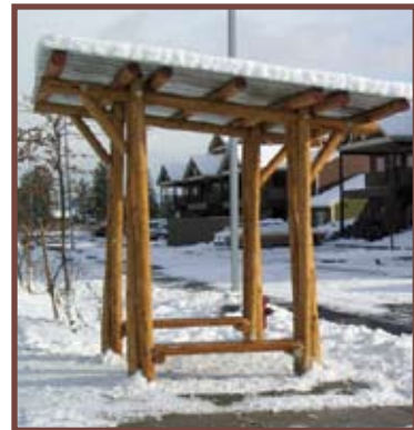
Pomegranate projects: entry signs, mailbox shelters, light posts, tables and benches, tea shelter, and a bus shelter.