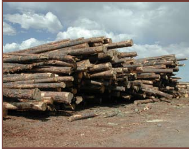
Small-diameter log supply.

To be moderately successful, Randy said, “We need to treat about a semi-load of material per week or about 25,000 board feet. We hope to be treating about 3 million board feet a year after the first year. There is a huge