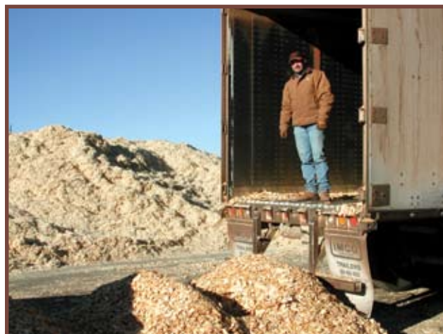
Raw material (wood residue) just arriving at the plant.

The material is stored and eventually transferred into an in-feed system where it is metered into a screen, which separates the chips from the sawdust. The chips are passed through a pre-grinder and mixed with the sawdust. The material then goes into the dryer, where it is dried to the proper moisture content. The sawdust is conveyed onto a screen, which separates the fine sawdust from the coarse material. The coarse material goes through a hammer mill to be reduced in size and recycled back into the system. The refined material is then metered into the die where the pellets are formed. The pellets are cooled and then conveyed into a storage silo. The wood pellets can then be packaged into 20- or 40-lb bags, or bulk delivered for central heating customers.