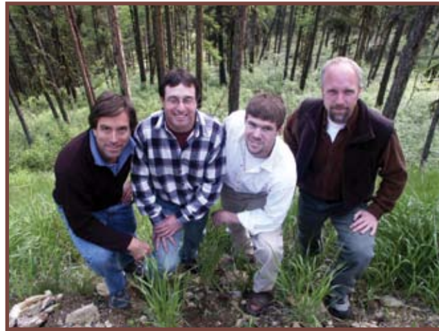
Owners of North Slope Sustainable Wood, LLC.

Wood flooring has a prime market when cut from high-quality hardwood and softwood species. Although hardwood species are generally more popular as a flooring material, higher density softwood species are also used. Softwood species regularly manufactured into flooring include southern pine, Douglas-fir, western hemlock, and western larch.