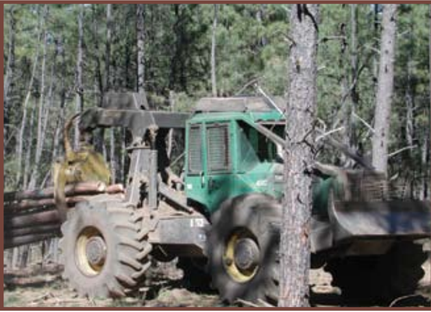
Grapple skidder operating on restoration project.

Pinetop, Arizona. This forestland is on the Apache–Sitgraves National Forest and is part of the White Mountain Stewardship Contract. Wildland–urban interface areas comprise about 80% of this stewardship contract.