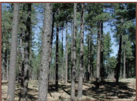
Wildland–urban interface project: White Mountain Stewardship contract after restoration.