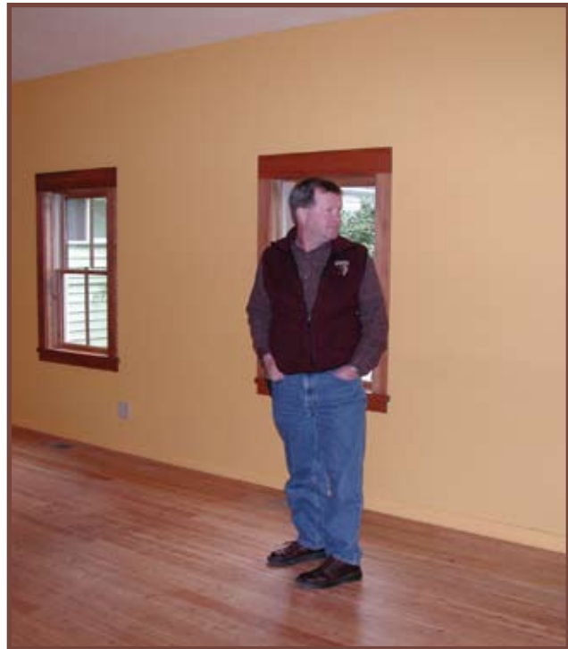
Amy's dance floor.

Some literature erroneously suggests that wood cut from small-diameter trees is weaker than wood cut from large-diameter trees. USDA Forest Service research has established that the properties of wood from small-diameter trees may be just as good as those cut from large-diameter trees.