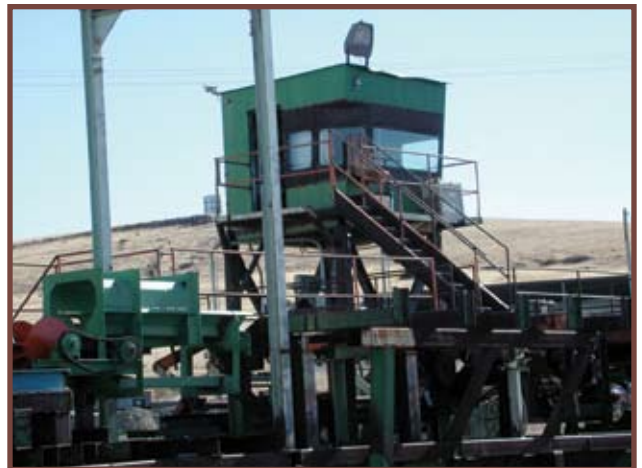
Debarker and bucking station.

American West Structures, a wood business located very close to Terry's small-diameter sawmill, could be Terry's largest customer of small-diameter lumber if they were able to kiln-dry their lumber to the required 8% moisture content.