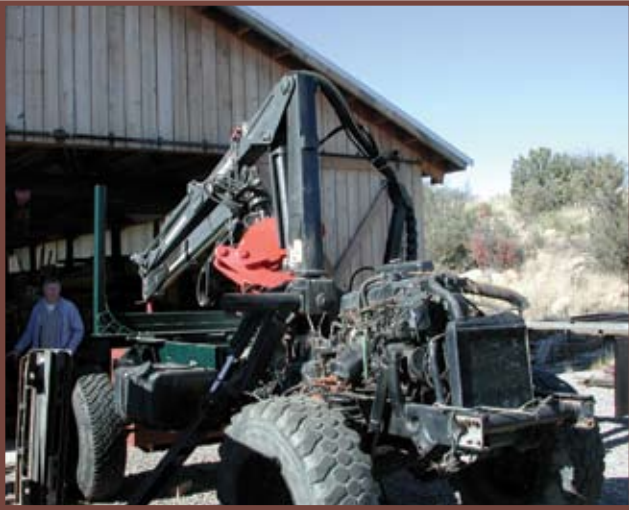
Unilogger, an improved version of the earlier small forwarder.

thinning; felling, limbing, bucking, and forwarding several hundred trees per day with a crew of two.