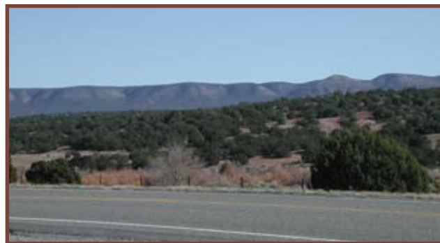
Dense juniper and pine in a very dry climate.

developing products of higher value. One of those products is Altree™—a wood–plastic composite that has high value and has been a success for this company and the community.