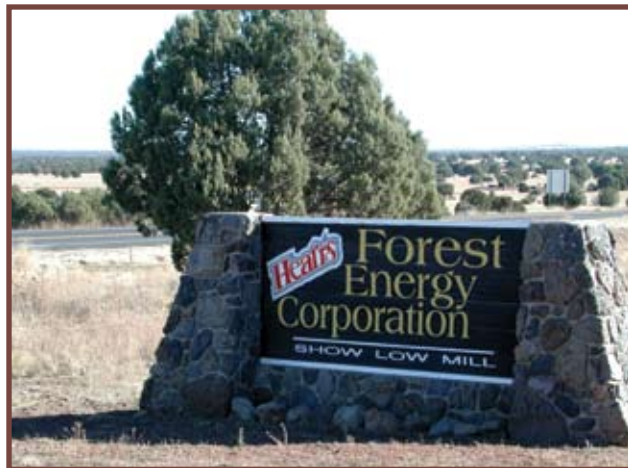
Forest Energy Corporation, outside Show Low, Arizona.

The wood pellet manufacturing process starts when loads of raw material arrive at the plant.