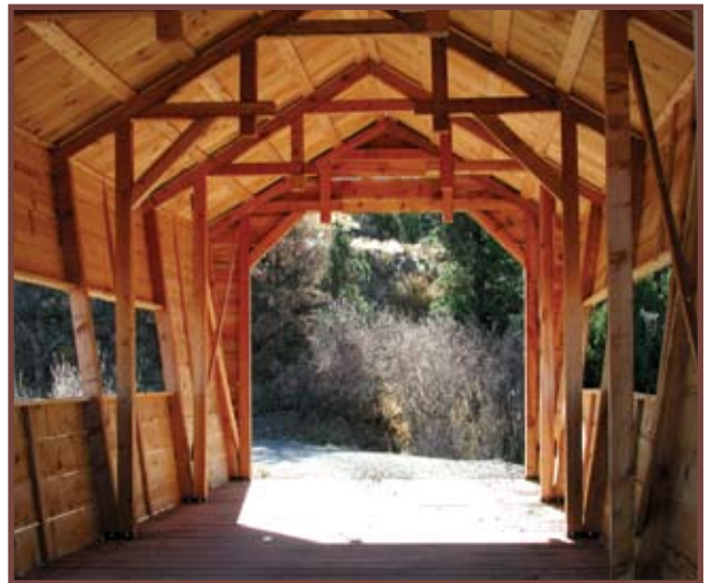
Vehicular bridge manufactured from pre-assembly glue-laminated wood trusses.

In 2005, American West Structures received a National Woody Biomass Utilization grant (see p. v) from the USDA Forest Service to purchase deck laminating press equipment and to secure increased capacity to dry lumber to 8% moisture content. Rather than build their own dry kiln, American West Structures is helping to fund a dry kiln at Reidhead Brothers sawmill, another White Mountain Stewardship contract partner, where the kiln will benefit both businesses.