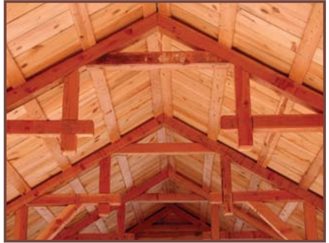
Construction of small-diameter building to house deck laminating press equipment.

American West Structures, LLC 2000 West Central Avenue P.O. Box 2008 Eagar, AZ 89525