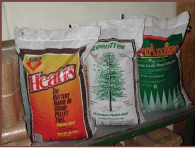
Wood pellets packaged into bags.

Wood pellet plants voluntarily follow standards to create a product that is consistent in content, density, size, and quality. Forest Energy Corporation takes great pride that they are known for producing a high-quality product. There are currently two grades of pellet fuel: standard and premium. The main difference between the two is that the standard grade contains more ash than the premium grade. Pellet manufacturers are encouraged to label their fuel and have it tested regularly.