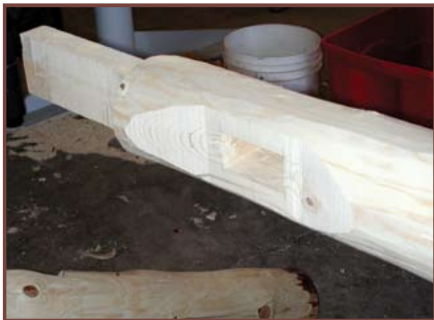
Hand-peeled and notched small-diameter poles are used in log cabins, allowing natural logs to be used in traditional timber frame construction.

vision of forest restoration meshed with my logging equipment and forestry techniques, but the scale of Santa Clara Woodworks operations was too small to achieve landscape-scale results in the forest.”