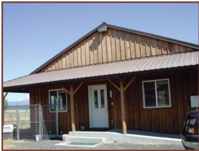
Dodge Logging, Inc., headquarters outside Maupin, Oregon.

companies and hope to add at least 10 more jobs as a result of their latest expansion.