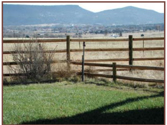
Log rail fencing.

pay more for the raw material, and that ultimately helps reduce the cost per acre of forest restoration.