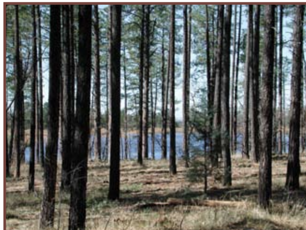
500-acre wildland-urban restoration project, Woodland Lake Park, near Pinetop, Arizona.

In 2005, W.B. Contracting received a grant from the USDA Forest Service National Woody Biomass Utilization Grant Program (see p. v) to purchase a versatile whole-tree log forwarder.