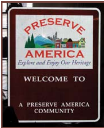
First Lady Laura Bush's Preserve America sign.

railing, spindles and posts, picnic tables, sandboxes, trash can holders, park benches, window boxes, tool handles, shims, window boxes, landscape timbers, and grading stakes and in marine and waterproofing situations in place of treated plywood and pressboard.