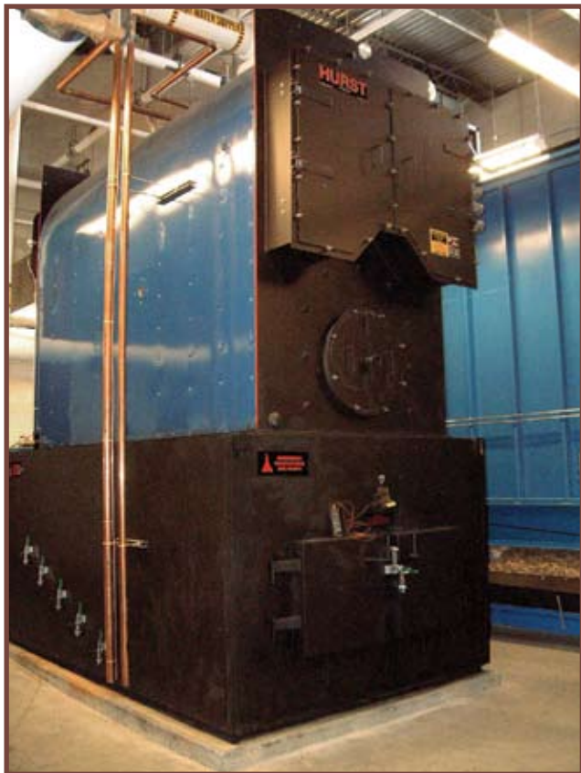
Woodchip boiler inside the biomass power plant.

The college began by wanting to cut its energy costs and now has progressed to becoming an authority on sustainable and renewable energy. Their goals have evolved into reducing greenhouse gas emission levels, teaching students about renewable energy sources, and helping to advance woody biomass as a viable energy option. Mount Wachusett Community College is definitely living up to its motto, "Education for a Changing World."