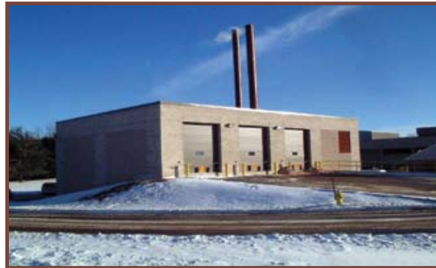
Mount Wachusett Community College's biomass power plant.