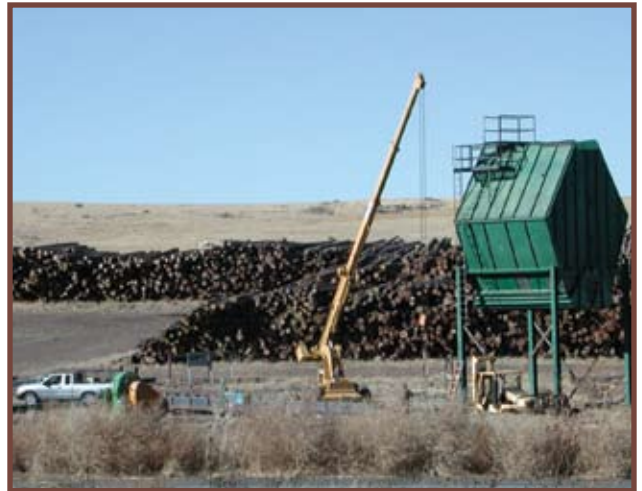
Mixed log supply from White Mountain Stewardship Contract.

Reidhead Brothers Lumber Mills Inc. P.O. Box 84 Nutrioso, AZ 85932