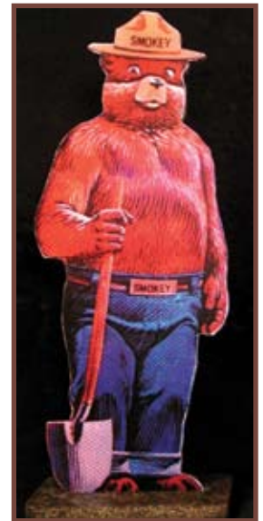
Smokey Bear sign made using Altree™ and coated with high-density reflective sheeting.