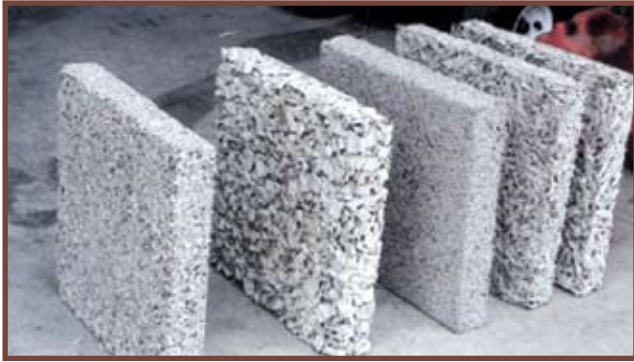
Chipcrete, a chip-based composite structural building block.

products and 80% is not. This 20% produces 80% of the business complex's revenue." All profits from Gila WoodNet are put back into forest restoration work and product development. Products from the company currently include vigas, poles, juniper posts, firewood, mulch, and chips.