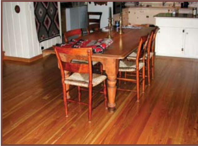
Larch flooring installed in Forest Service employee Angela Farr's home, Missoula, Montana.

softwood species. The physical and mechanical properties of small-diameter trees thinned from overstocked stands are dependent upon species, the age of the tree, and the conditions under which the tree is growing.