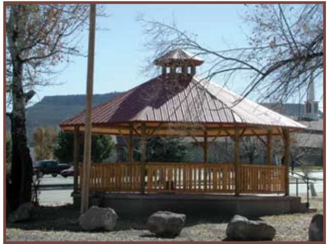
Gazebo built by Arizona Log & Timberworks, Eagar, Arizona.

Cheyenne Log Homes, Inc., dba Arizona Log & Timberworks 1990 W. Central Ave. Eagar, AZ 85925