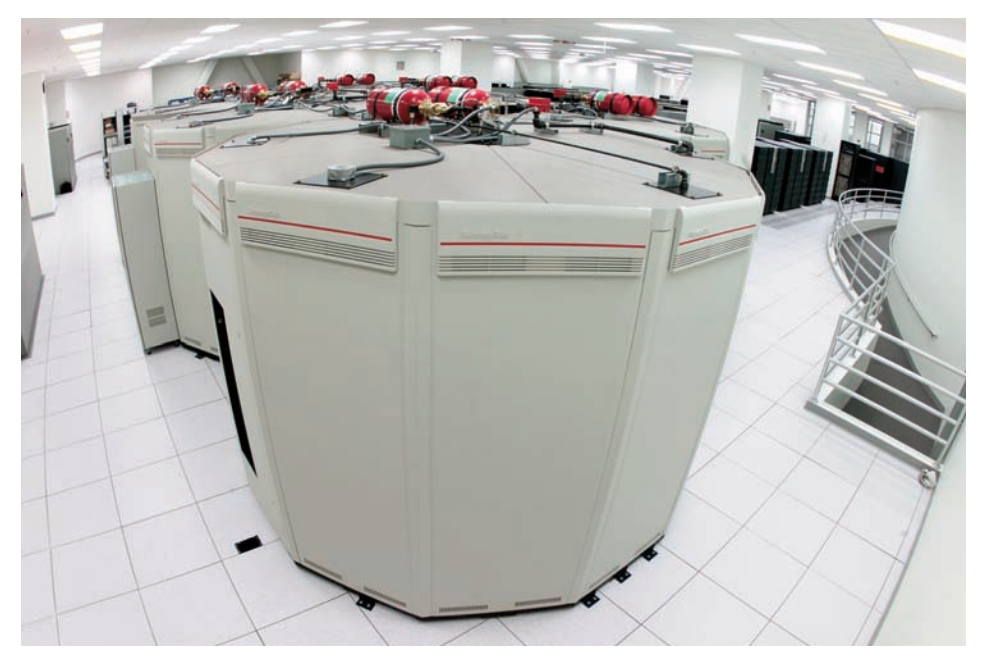
Cost Efficient Archive: HPSS at NERSC archives petabytes of data on systems consisting of spinning disks and tapes.

HPSS is software that efficiently manages petabytes of data (1,000,000 gigabytes) by moving information from highcost, high-speed disks to low-cost tapes,