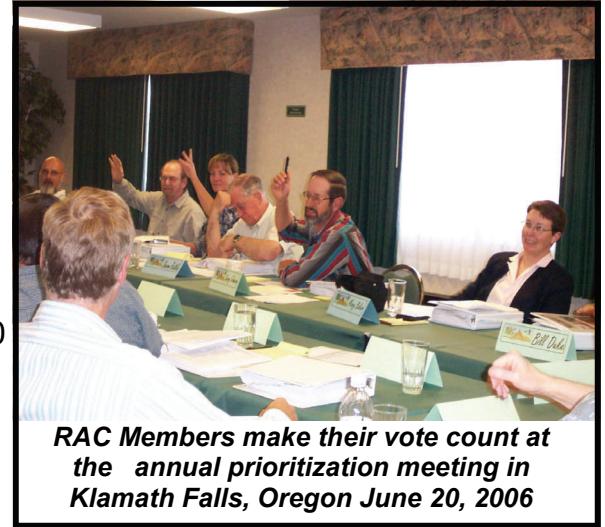
RAC Members make their vote count at the annual prioritization meeting in Klamath Falls, Oregon June 20, 2006