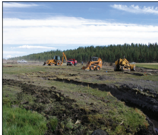
Brown Springs Creek Restoration is an example of a successful partnership between the USFS $90,000, USFW $38,900 and a private landowner giving more than $21,000 in in-kind contributions.