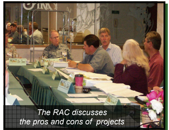
The RAC discusses the pros and cons of projects