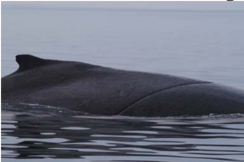
1879 line scar August 2004