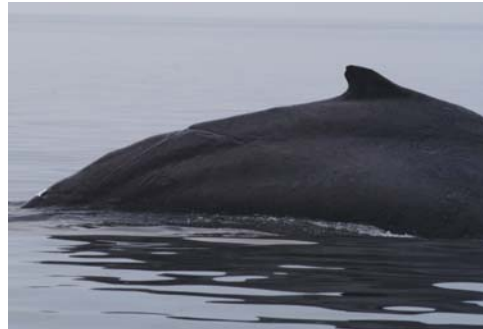
1879 line scar August 2004