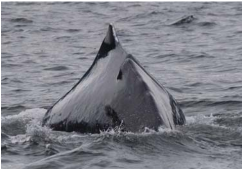
0910 healed injury June 2007