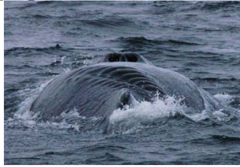
2018 healed injury December 2004