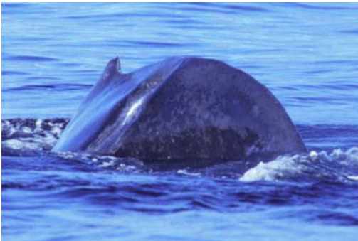
1207 healed injury November 2000