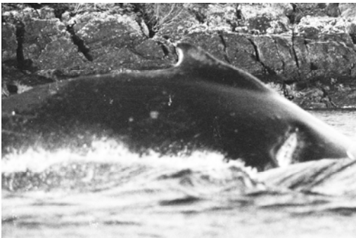
1071 healed injury December 1985