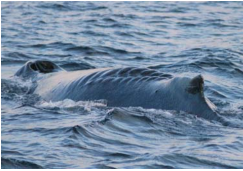
2018 healed injury December 2004