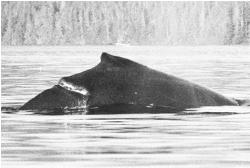
1742 first sighting January 2003