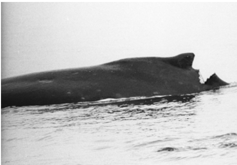
0576 fresh injury August 1986