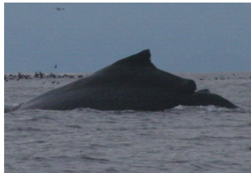
1742 healed injury May 2004