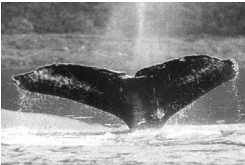
0577 unhealed injury present September 2000