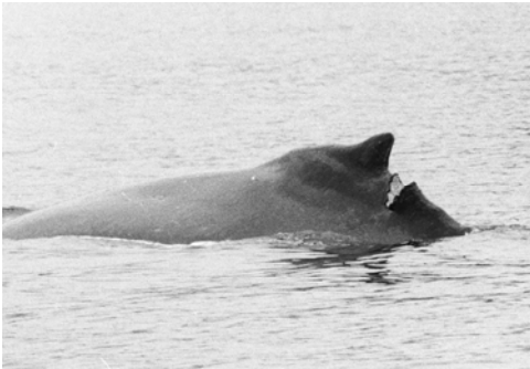
0576 fresh injury August 1986