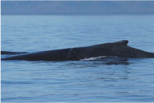
1043 healed injury August 2004