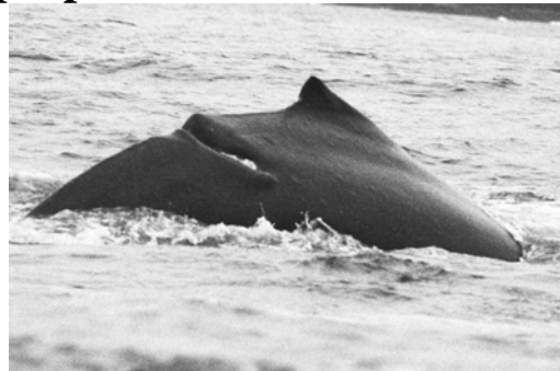
1742 healing injury February 2003