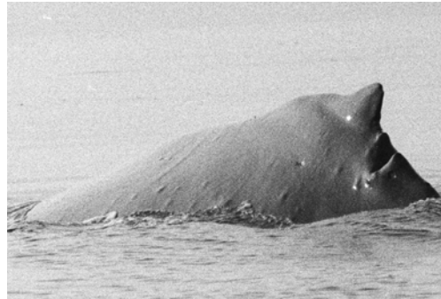
0576 healed injury December 2003