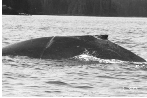
1043 healed injury August 2000