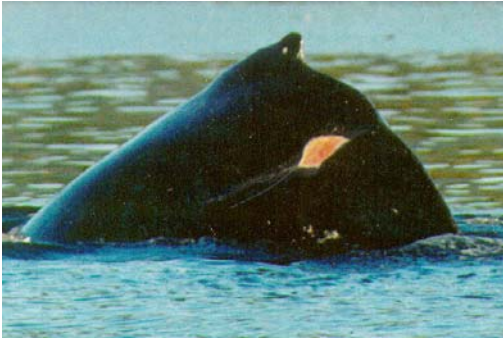
1207 fresh injury October 1995