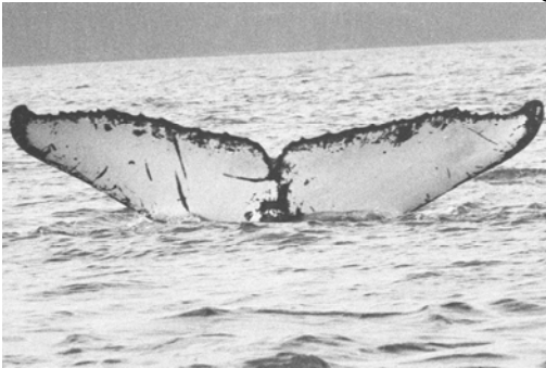
1638 before injury November 1998