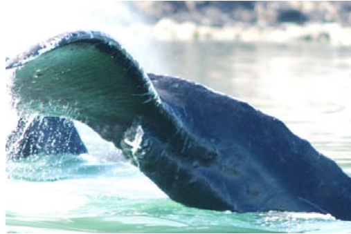
0166 unhealed tail stalk injury June 2004