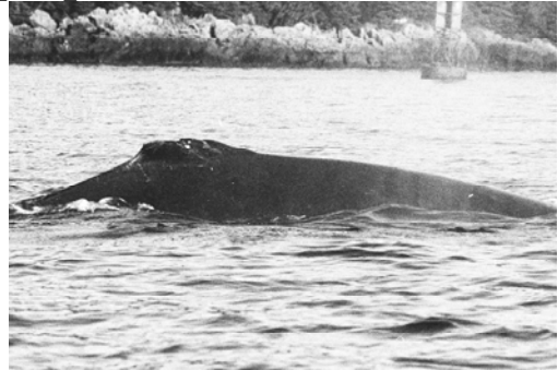
1073 healed injury November 1994