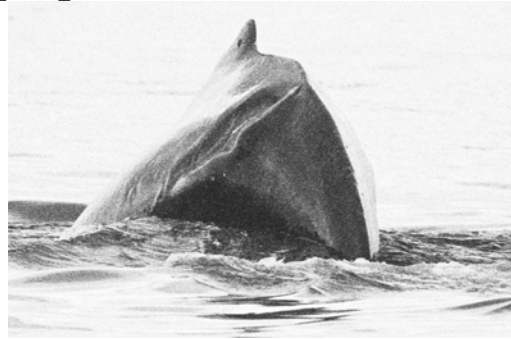
1207 healed injury October 1996