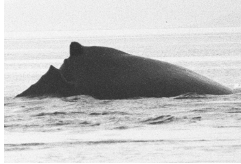
0576 healed injury May 2003