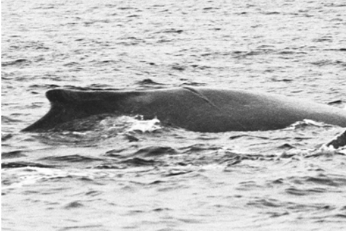
1043 healed injury October 1998