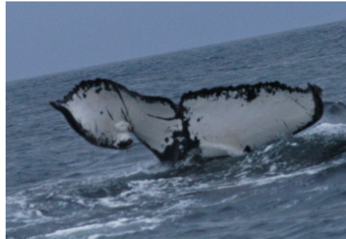
1638 after injury August 2005