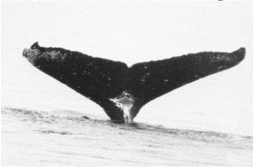
0924 first sighting August 1986