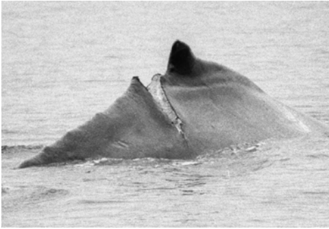
0576 fresh injury August 1986