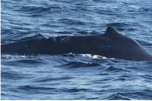
1620 healed injury October 2003