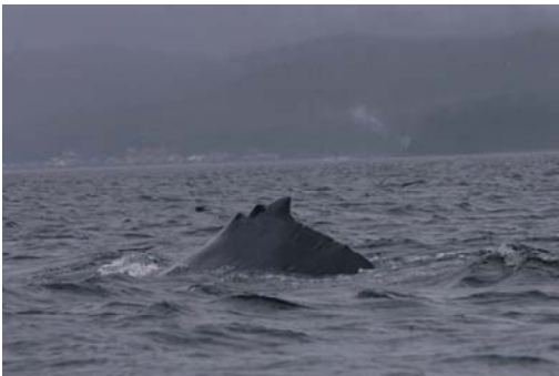
1073 healed injury April 2005