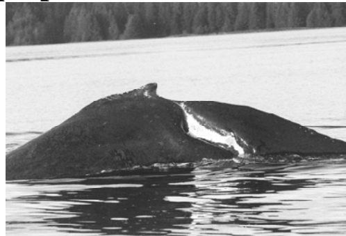
0954 healed injury December 2003