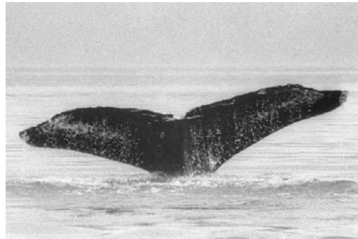
0577 injury slightly visible May 1997