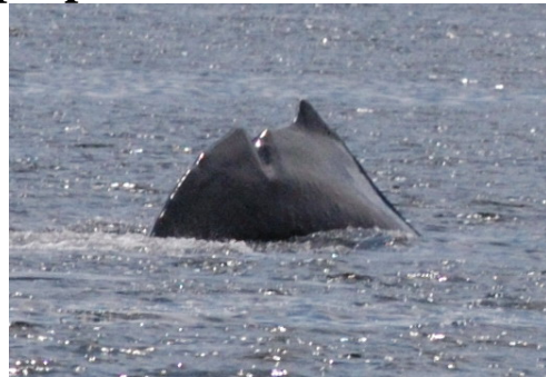
0910 healed injury June 2007