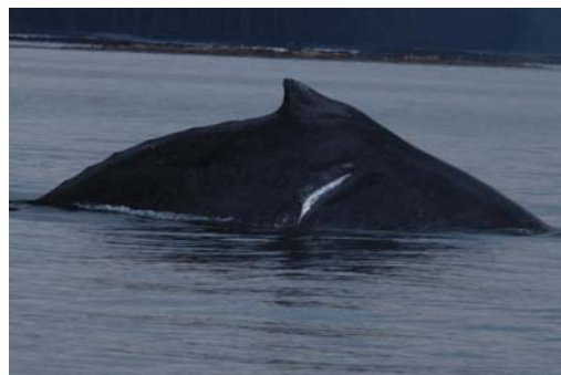
1071 healed injury August 2004