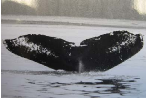
0577 before injury August 1994