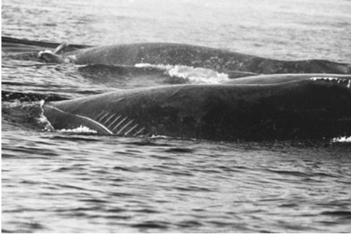
0998 healed injury September 1991