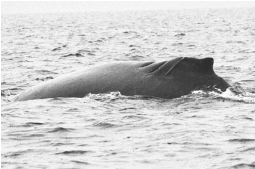
FS00-14(21) healed injury August 2000