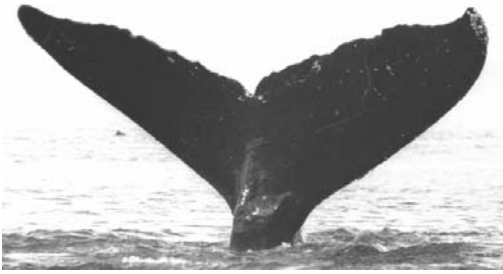
0166 unhealed tail stalk injury June 1990; year of injury unknown, possibly 1988