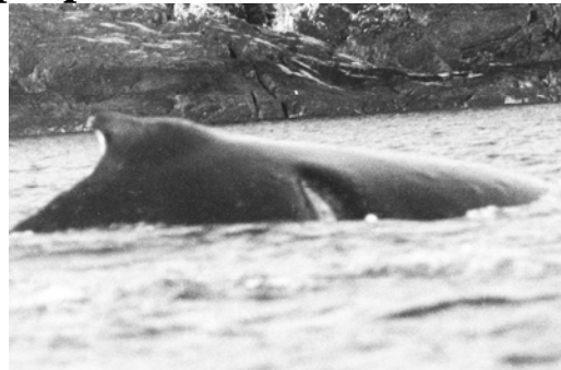
1071 healed injury December 1985