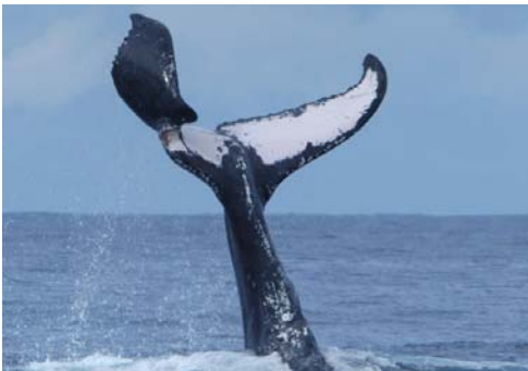
1638 after injury January 2006 Hawaii (S.Yin)