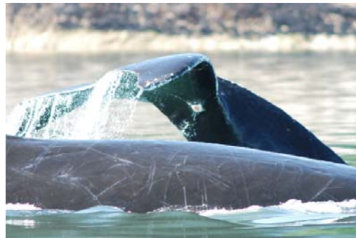
0577 unhealed injury June 2004