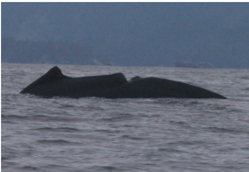
1742 healed injury May 2004