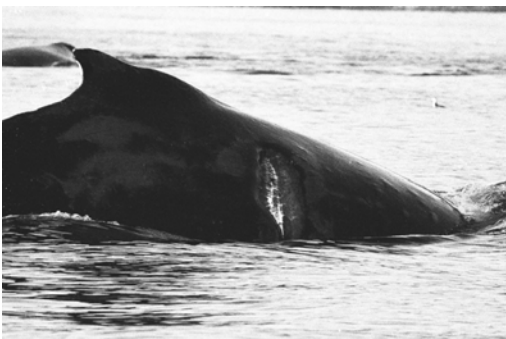
1071 healed injury December 1991