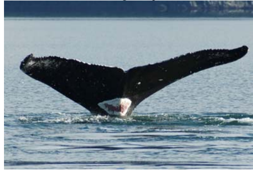
0924 unhealed injury November 2006