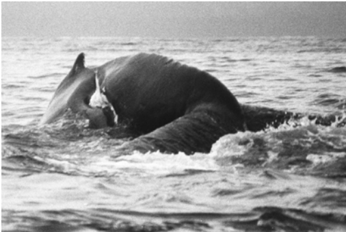
0954 healed injury August 1995