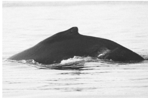
1207 healed injury April 2002