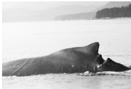
0576 healed injury December 2003