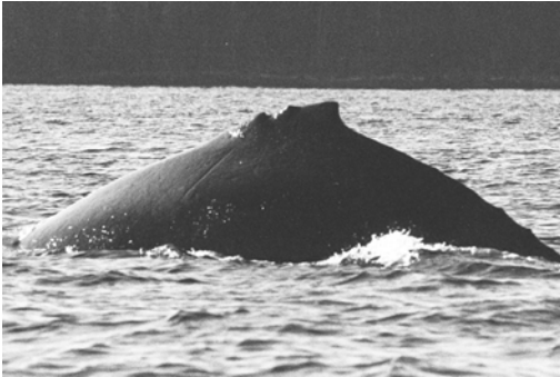
1073 healed injury November 1994