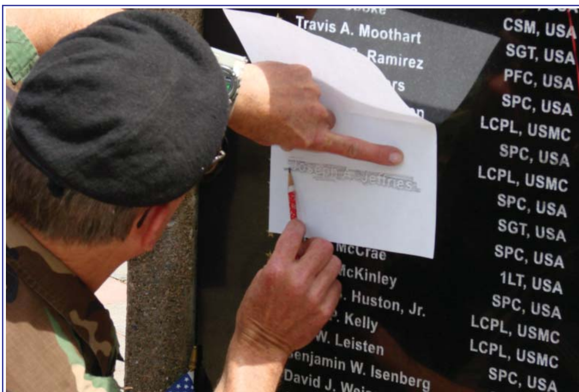
Photos, from left: Diverse groups of people gather near the memorial for the ceremony; The memorial has become a popular source of "rubbings," similar to the Vietnam Memorial; Gold Star families were there to honor and mourn their lost loved ones during the ceremony.