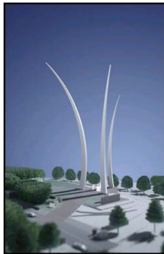
Architectural model of new memorial