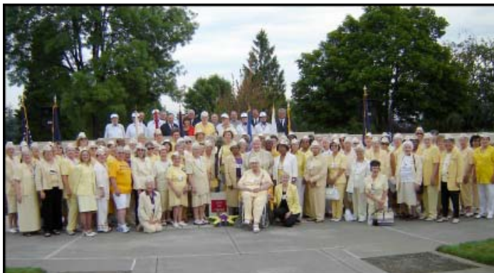
Gold Star Gathering - Delegates from the 2006 Gold Star Wives National Convention gather for a photo opportunity at Willamette National Cemetery.

A Saturday morning memorial service at the Willamette National Cemetery was held to honor the men and women who have paid the