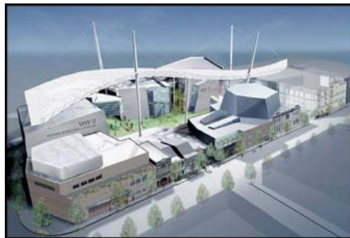
Upgraded Role: An architectural model of the proposed expansion of the current National D-Day Museum, now designated to be the National World War II Museum.