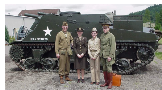
Living Historians dressed in WWII era uniforms stand in front of a “Priest” Howitzer Motor Carriage M7.

Located on the grounds of Camp Withycombe in Clackamas, Oregon, the main museum building’s exhibits pay tribute to Oregon’s military heritage from the nineteenth century through the present with aircraft, artwork, equipage, insignia, ordnance, tanks, uniforms and vehicles.