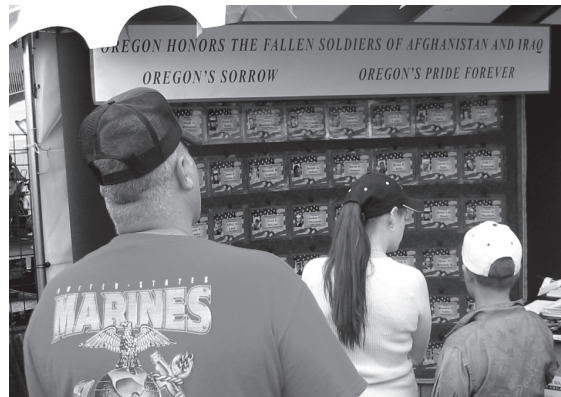
Visitors to the Oregon State Fair pause to reflect upon the ODVA's Memorial Wall display.

Each year, the Oregon Department of Veterans' Affairs (ODVA) employees staff a booth at the State Fair to provide information about veteran, survivor, and dependent benefits earned by veterans as a result of their military service. At the 2005 Oregon State