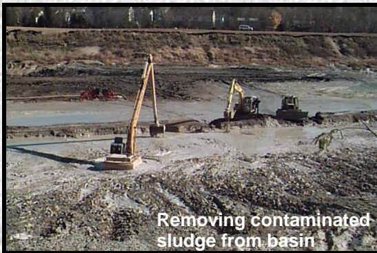
Removing contaminated sludge from basin

The Avtex Fibers Superfund site occupies 440 acres along the South Fork of the Shenandoah River in Front Royal, Va., about 70 miles west of Washington D.C.