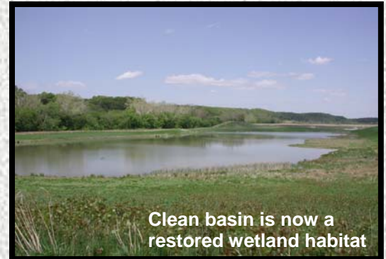
Clean basin is now a restored wetland habitat

The Avtex Fibers Superfund site occupies 440 acres along the South Fork of the Shenandoah River in Front Royal, Va., about 70 miles west of Washington D.C.