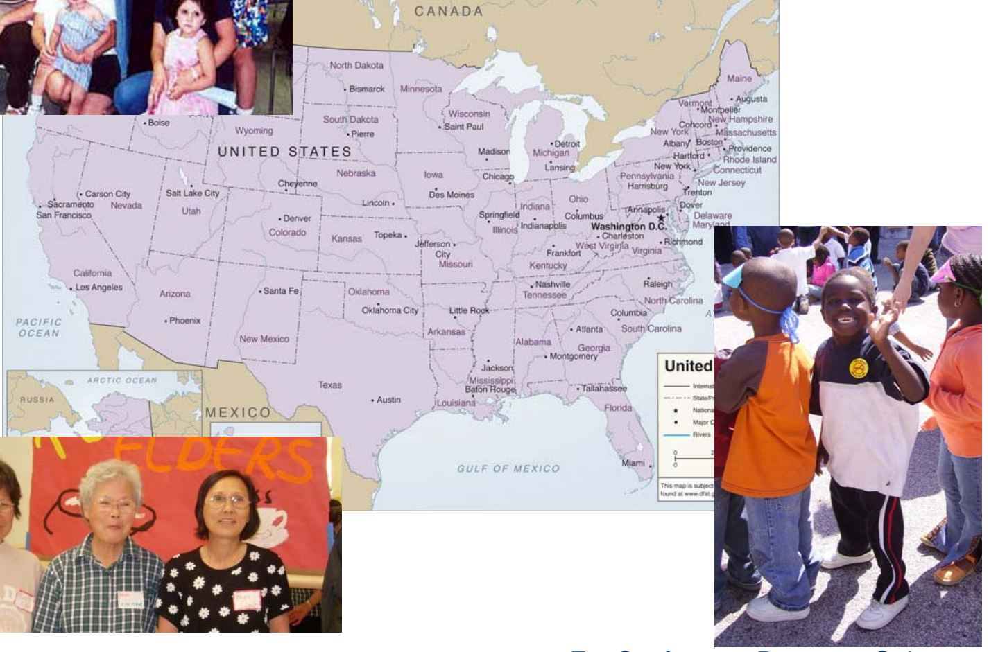
For Conference Purposes Only