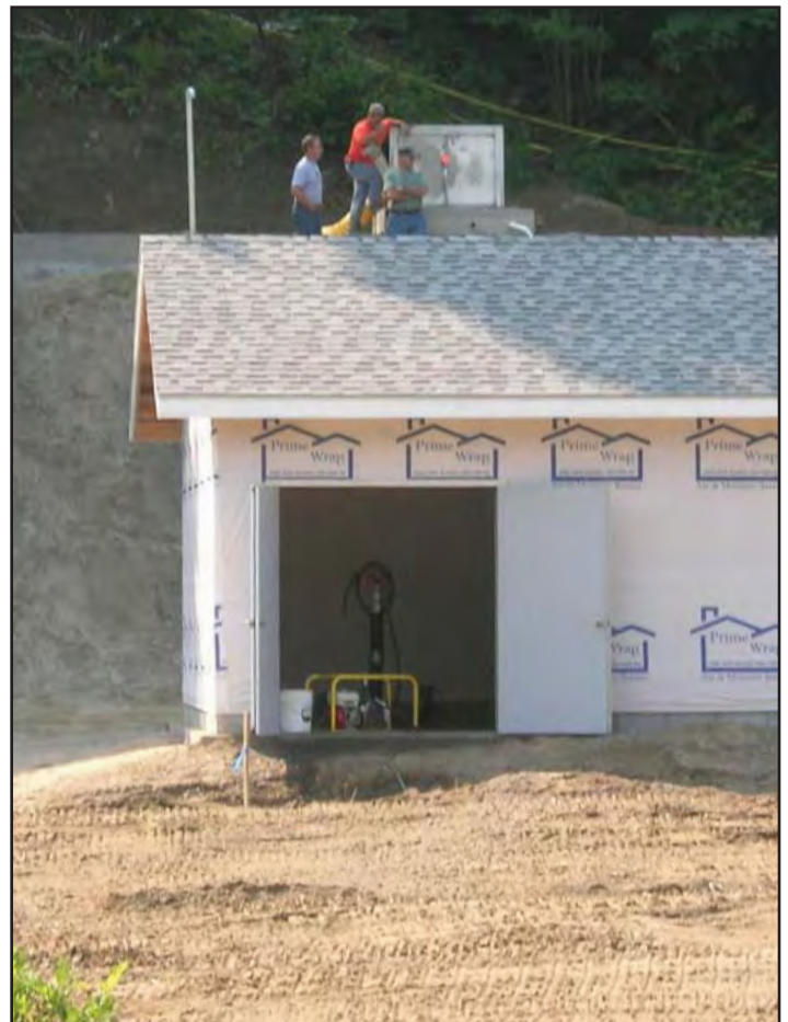
Pump Station Under Construction in Orford Village, NH.

The Vermont Department of Environmental Conservation offers grants for a range of water pollution control projects. Grant funding is available for phosphorus removal projects (100% grant of the eligible project costs); sludge and septage projects at wastewater treatment facilities (50% grant on sludge and septage train); CSO projects (25% grant of all eligible costs); and dry weather pollution abatement projects (35% of all eligible costs). Further information about these grants can be obtained from Don Robisky at (802) 241-3734.