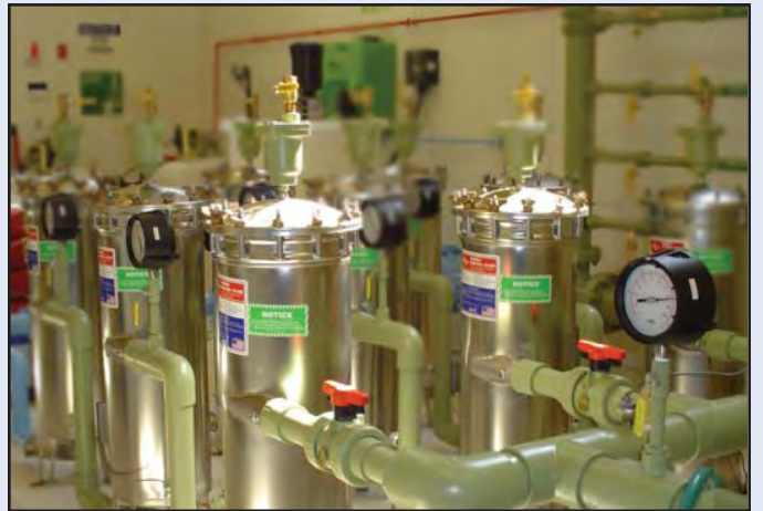
New Water Treatment Plant Filters and Distribution System in the Town of Newbury, VT.