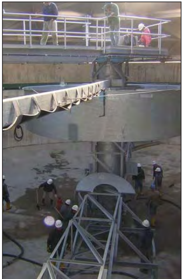
POTW Finished Clarifier in Sanford, ME.