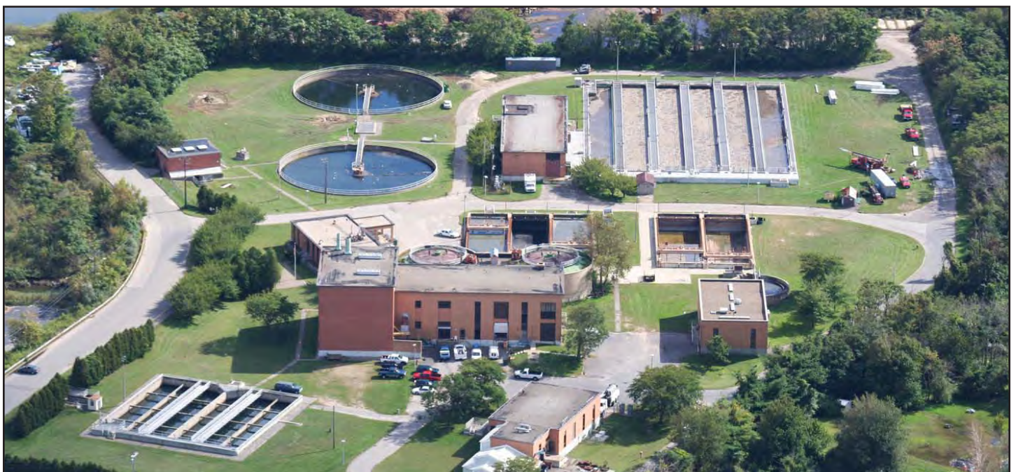
Wastewater Treatment Plant in Stratford, CT.

Localities may receive up to $500,000 per year if (1) they are not designated as a distressed municipality or a public investment community, and (2) the State Plan of Conservation Development does not show them as having an urban center. For more information about this program or about eligibility, contact Lisa DuBois at (860) 418-6209.