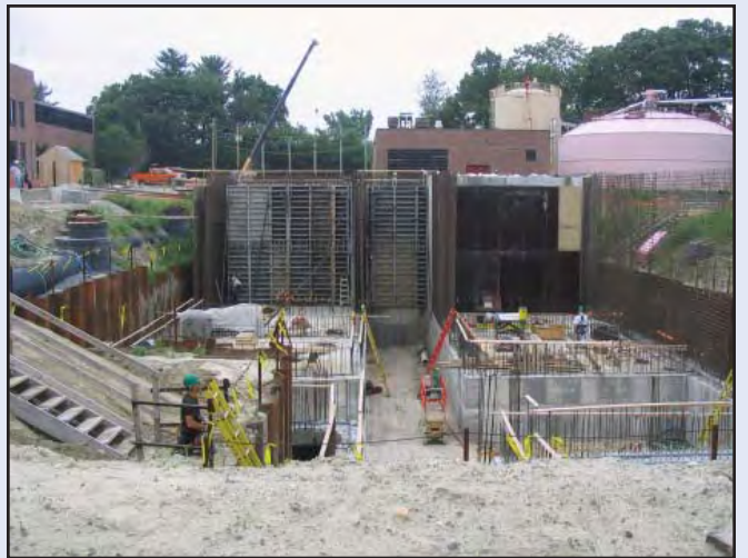
Wet Weather CSO Facility Construction in Nashua, NH.