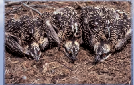
35-40 day-old ospreys

Research reveals that ospreys can warn us of harmful environmental conditions in and near our communities. We can return the favor by doing what we can to make the environment safer for the birds—constructing and maintaining safe, appropriate nesting platforms, and keeping our waterways clean. This sort of coexistence between wildlife and humans contributes to our survival as well as that of other species on this planet.