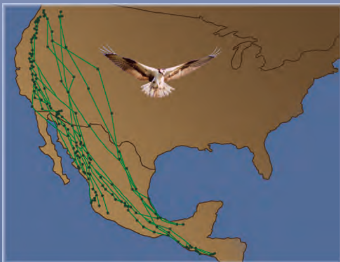
The annual migration of osprey has been traced from Oregon and Washington to various locations in Southern Mexico and Central America.

to ospreys and tracking their movements with satellite receivers. Members of adult osprey pairs migrate separately and winter at different locations, reuniting each spring at the nest after a six-month hiatus. Thirteen ospreys have been tracked to southern Mexico, one to El Salvador, and one to Honduras, each following its own route annually. Many osprey winter in coastal areas like Mazatlan and Puerto Vallarta. Ospreys nesting in other parts of the United States winter farther south into Central and South America. The World-Wide Web makes it possible for the results of the osprey satellite tracking to be widely available through