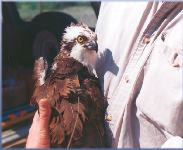
An osprey fitted with a temporary transmitter for tracking its migration via satellite (note: antenna on back).

Scientists study the migration routes of adult osprey from nest sites in western Oregon to wintering grounds by temporarily attaching small transmitters (1.15 ounces; 30-35 grams)