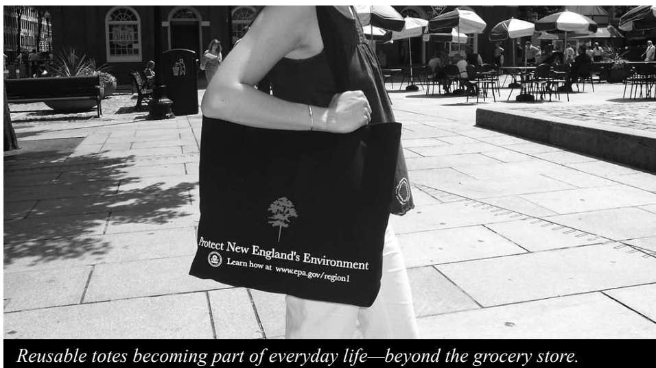
Reusable totes becoming part of everyday life—beyond the grocery store.

It's necessary that people realize that our actions can turn these life necessities into harmful constituents; the water, air and soil that support our survival is only as healthy and clean as we keep it. Perhaps paralleled with current economic stress, this realization that our environment is all around us and needs our support is spreading.