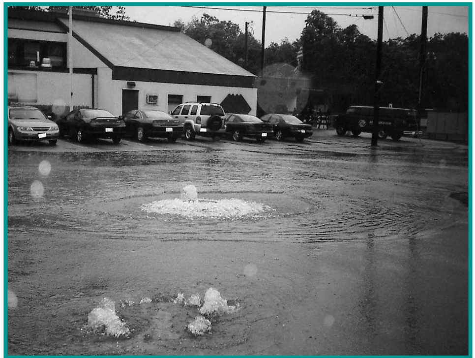
Two overflowing manholes flooding a street and parking lot in Rhode Island with contaminated water.

Prevention of SSOs is necessary to protect public health and enhance the quality of life for communities. Cleaner water will significantly decrease the number of viruses, bacteria, and parasites which appear in high numbers following an SSO. This is especially important to the elderly and children who commonly have more suppressed immune systems and are more likely to suffer.