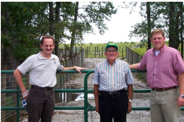
Partners for Fish and Wildlife biologist with landowner and a representative of the Georgia Soil and Water Conservation Commission.