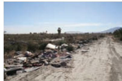
Road in Torres Martinez Reservation before cleanup.

THE RESOURCES: The collaborative funded these successes by leveraging $2 million from the California Integrated Solid Waste Management Board ( www.ciwmb.ca.gov/grants or (916) 341-6000). The collaborative has also initiated targeted brownfields assessments (page 23) to facilitate productive reuse of former dump sites.