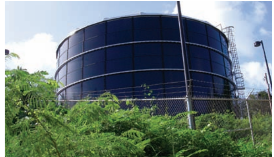
EPA provided nearly $3 million in grant funding to construct this one million gallon water storage tank and improve the distribution system in the Kannat Tabla area on the island of Saipan, in the Commonwealth of the Northern Mariana Islands (CNMI). The new tank is part of a number of system improvements that will eventually lead to 24-hour water on Saipan.

into the territory's waters, protecting health and nearby coral reefs. In one watershed, the team reduced bacterial contamination by over 90%. No deaths have been attributed to the disease in 2007 or 2008.