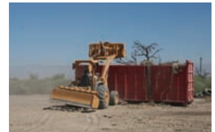
Road in Torres Martinez Reservation after cleanup.