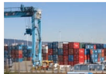
Port of Oakland

The collaborative, EPA Region 9's EJ Program, and 18 community organizations have also worked in partnership to create the Healthy Homes/Indoor Air