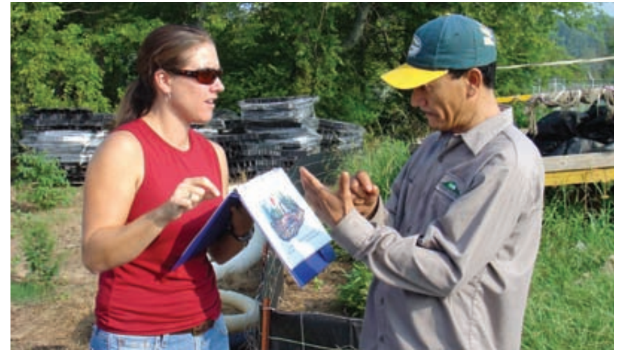
A pesticide inspector interviews a Spanish-speaking farmworker.

tion with 24-hour access to water from 26% to over 60%. With the implementation of the new requirements beginning in 2009, even more significant improvements are expected to move the island closer to achieving a safe, reliable drinking water supply for all residents.