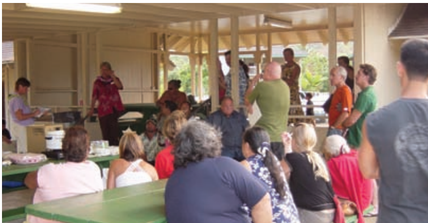
Kauai community meeting to receive input on the State's of Hawaii's Environmental Justice Initiative.

Many hair and nail salons in California use chemicals that may endanger the health of thousands of workers, their children, and customers. Salon workers often report respiratory problems and headaches, and their risk of cancer,