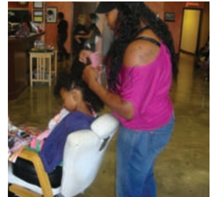
Reducing exposure to toxic chemicals at hair salons.

The information from the research and roundtables will be used to develop a "Healthy Hair Care Guide" to identify and promote safer and healthier hair styles and techniques. It will serve as