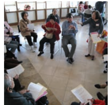
Community members meet to discuss the “Oak to 9th” redevelopment project.

THE RESULTS: APEN built a coalition of hundreds of working class people to influence the developer and the Oakland City Council to agree to build 465 units of housing affordable to families earning $25,000 to $50,000 (for a family of 4)—the highest number and percentage of extremely/very-low income units in a private project in Oakland in more than a decade. At least 232 units will be two or