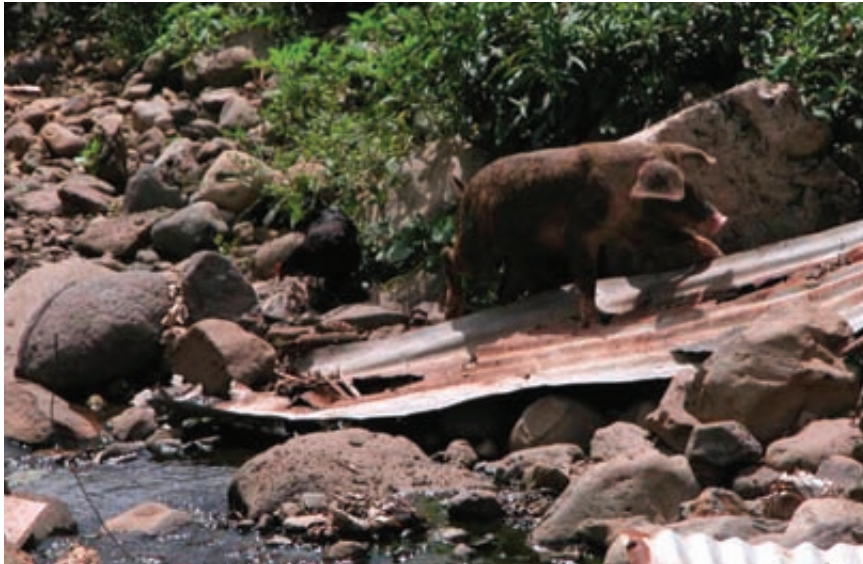
Outbreaks of leptospirosis are usually caused by exposure to water contaminated with the waste of infected animals, such as pigs.

THE RESULTS: "Team Lepto" has significantly reduced the pig waste discharged