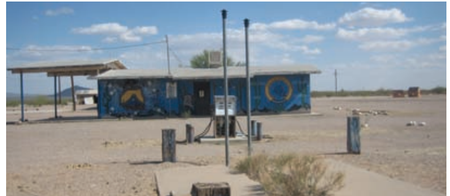
Lower left and above: Cleaning up petroleum contamination at a former Underground Storage Tank site, in Tuba City, Arizona.

In the CNMI, CUC and the Commonwealth's Water Task Force are implementing improvements to Saipan's drinking water and wastewater systems. Actions since 2006 on Saipan have increased the proportion of the popula-