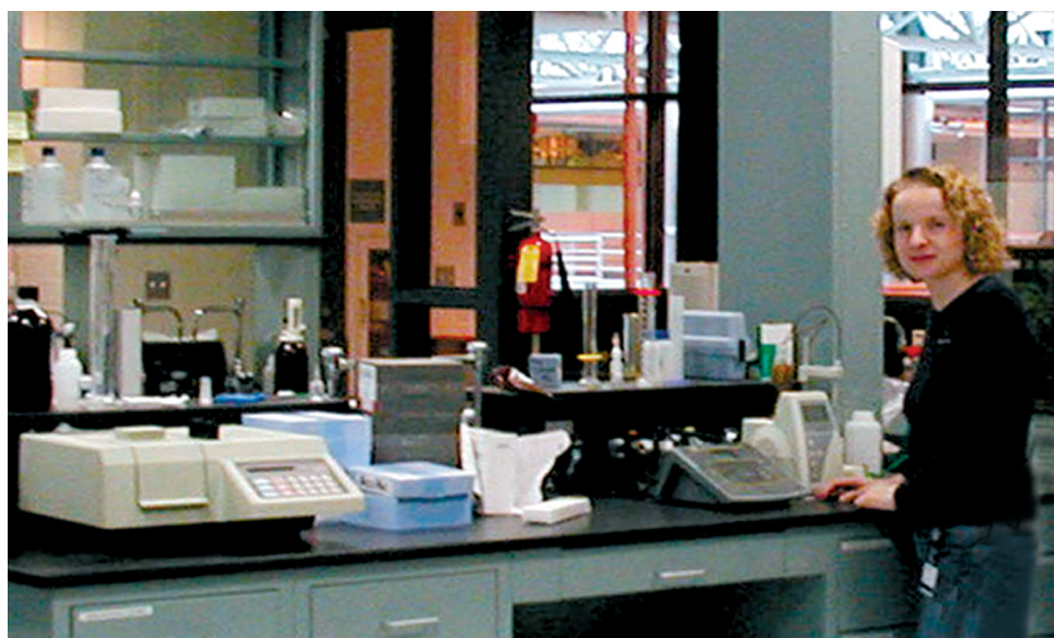
Figure 5. Cambridge Water Department Laboratory