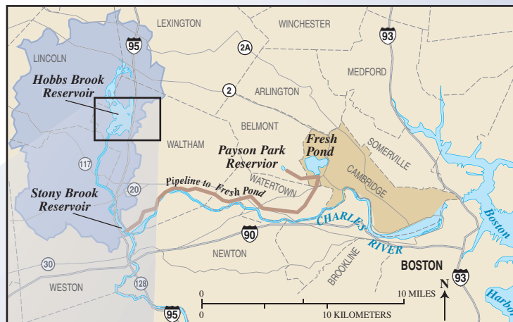
Figure 1. Location and extent of the Cambridge, Massachusetts, drinking-water-supply system.

From September 1997 through November 1998, the U.S. Geological Survey (USGS), in cooperation with the City of Cambridge, Massachusetts, Water Department (CWD), studied the water quality of Cambridge's three drinking-water supply reservoirs and their tributary streams. Although highway and urban stormwater runoff adversely affected some tributaries, the reservoir system ultimately delivered high-quality water to the treatment plant. Using data from this study, the USGS and CWD developed a comprehensive monitoring program for the drinking-water source area and designed a new investigation that examines how storm-water runoff affects tributary- and reservoir-water quality.