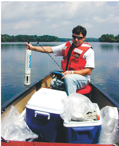
U.S. Geological Survey and Cambridge Water Department staff collecting reservoir samples.

A water-quality and ecological assessment of the system's three reservoirs identified seasonal variations in sodium, chloride, and other constituent concentrations in the reservoirs, and showed that ecological conditions improve as water moves through the system. Waldron and Bent (2001) discuss sample collection and analysis of physical, chemical, and biological data from the reservoirs.