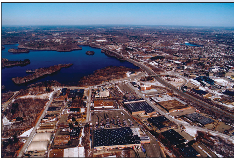
Figure 2. Aerial photo of Hobbs Brook Reservoir in the Cambridge, Massachusetts, drinking-water source area.

As part of its mission to understand and help protect the quality of our Nation's water resources, the U.S. Geological Survey conducts investigations that help municipal water suppliers manage their local drinking-water resources. One such study, begun in 1997 in cooperation with the City of Cambridge and completed in 1998, was designed to identify sources of contaminants in the city's drinking-water