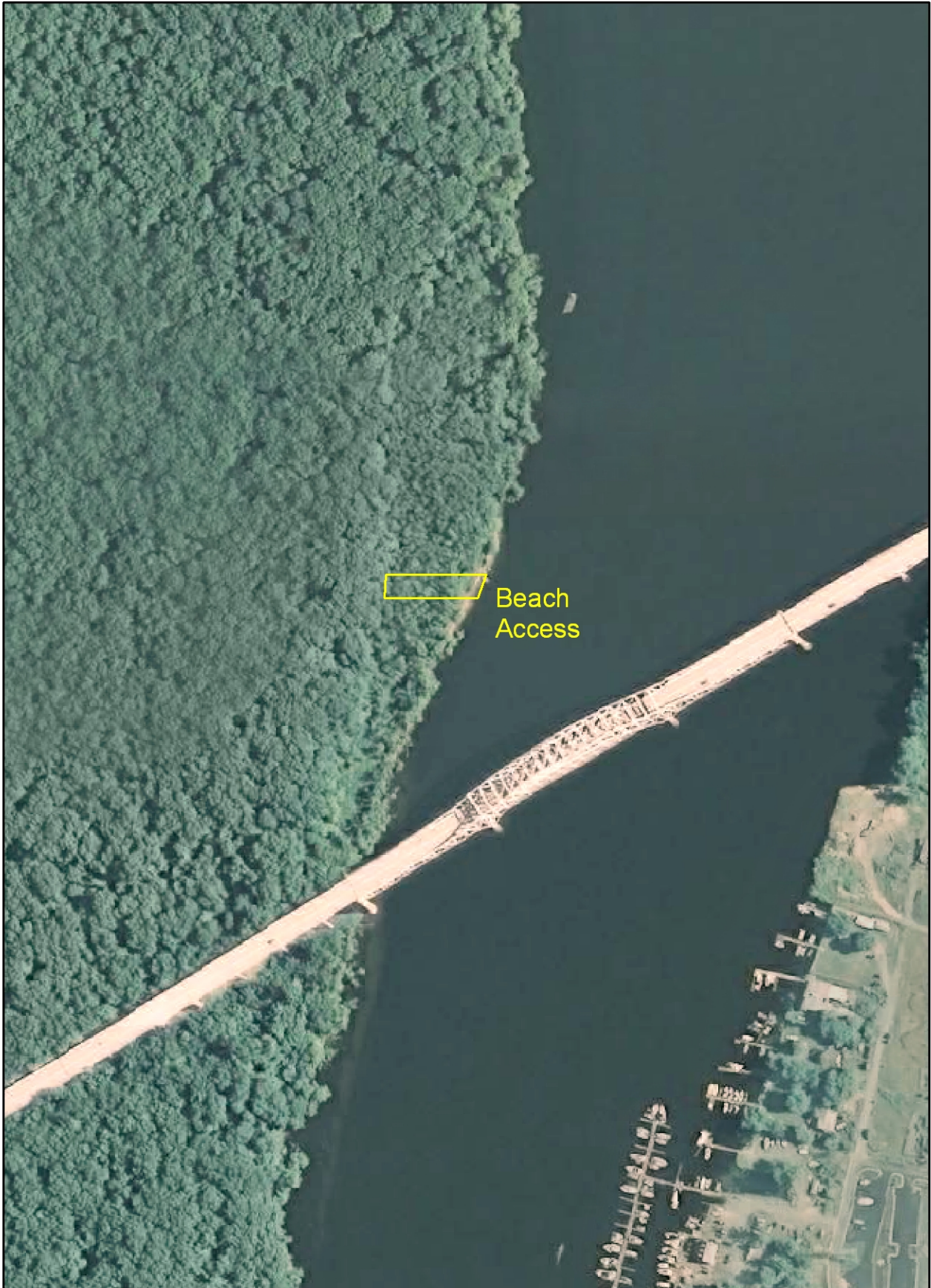
Base Imagery 2007 True Color