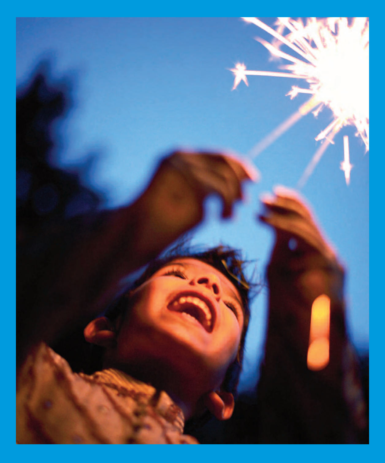
20th annual gsa child care training conference