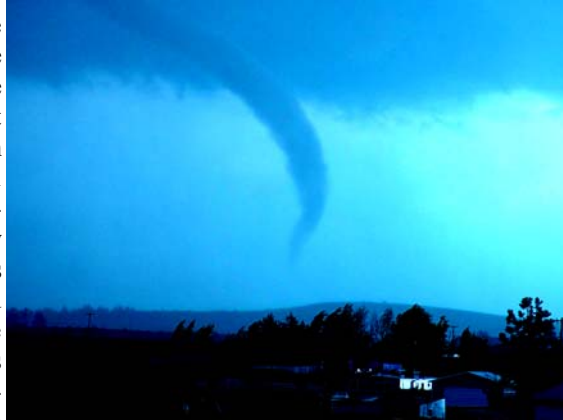
The F1 tornado in Airway Heights 5/21/04.

In the past, the NWS would issue Tornado or Severe Thunderstorm warnings for an entire county. The use of polygons allows the forecaster to be more specific by warning only those parts of the county that are affected by the storm. This is especially important in the western U.S. where the counties are typically much larger. With polygons,