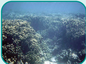
Healthy coral reef