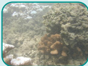
Mud-damaged coral reef

Healthy coral reefs provide homes for thousands of different plants and animals; storm protection for beaches and coastal communities; recreation for scuba divers and beachcombers; medicines for cancer and AIDS; and local jobs in tourism and fishing. If local land use managers reduce the mud washed offshore, coral reefs will stay healthier.