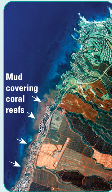
Air photo of West Maui

Scientists from the USGS, the University of Hawaii (UH), and the University of Washington (UW) are studying the coral reefs near several Hawaiian islands. Using air photos, satellite photos, underwater photos, and underwater instruments, we've found that mud washed offshore by large storms can damage coral reefs. Corals need sunlight and clear water to grow. When sunlight is blocked by muddy water, the corals stop growing and sometimes die.