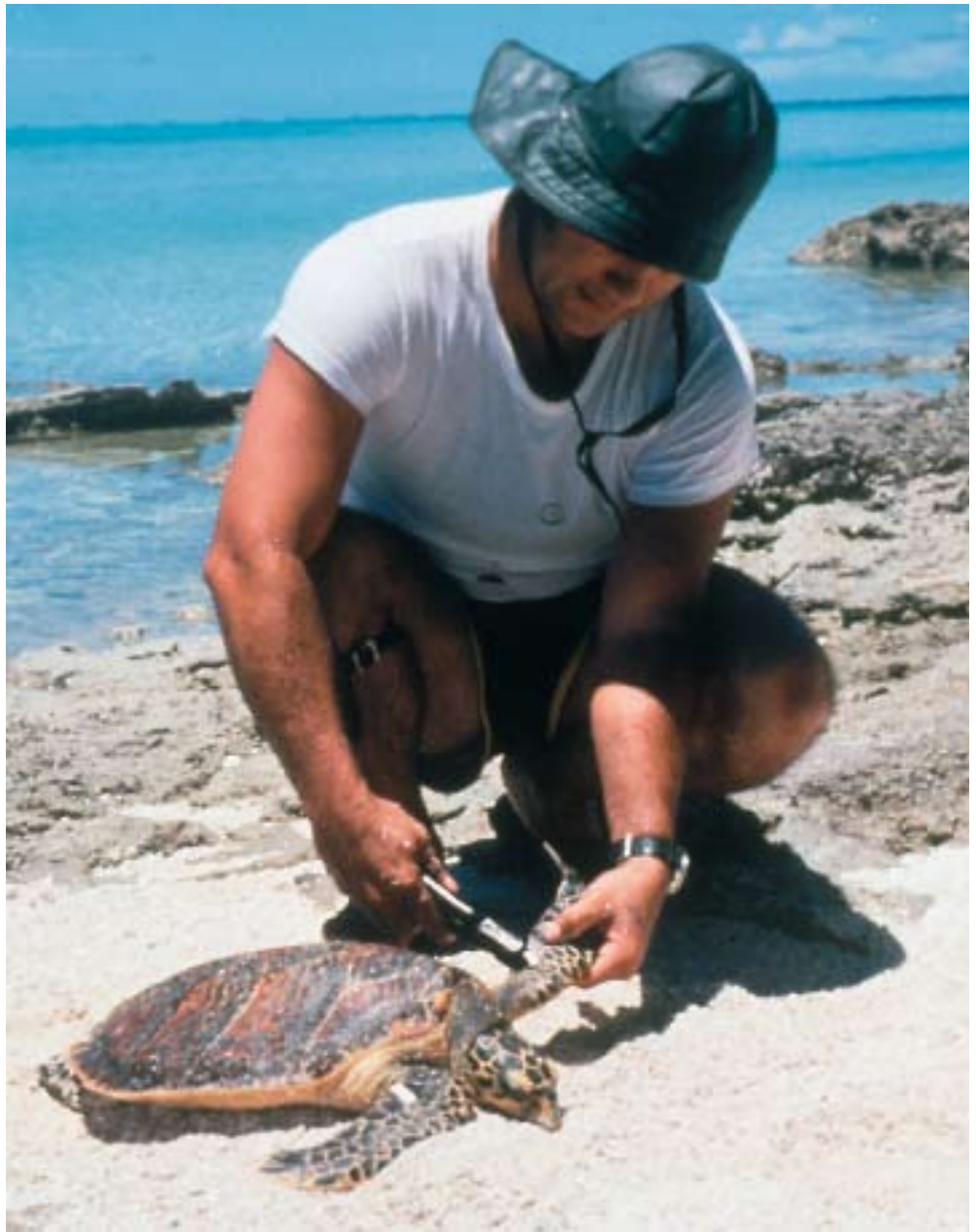
Conducting scientific research involving endangered or threatened species (such as monitoring sea turtle behavior through tagging, above) requires an endangered species or threatened species recovery permit.

Antiques, including scrimshaw, may be imported into the United States if accompanied by documentation that shows the article is at least 100 years old