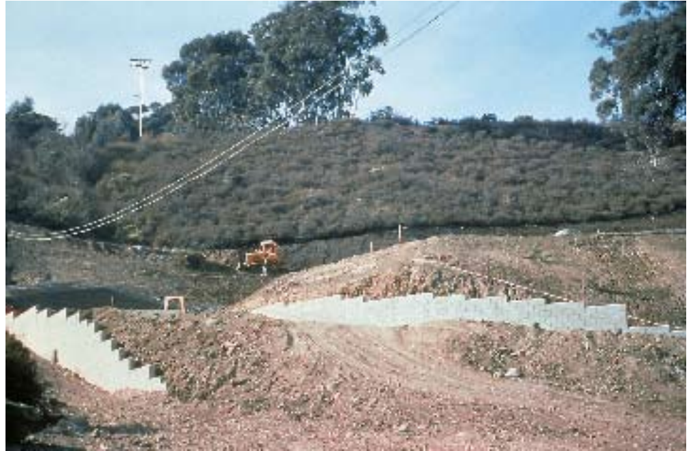
An incidental take permit allows for land development and the incidental take of listed species that may result from otherwise lawful activities. To offset the take, developers agree to implement conservation measures to minimize and mitigate the impacts to the species.

The activities authorized by permits differ depending on whether the species is listed as endangered or threatened. An endangered species is in danger of extinction throughout all or a significant