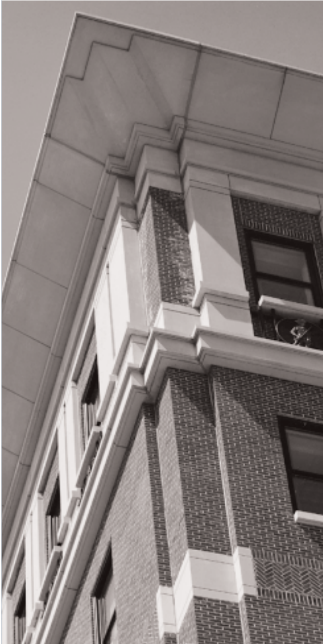
White Plains Courthouse