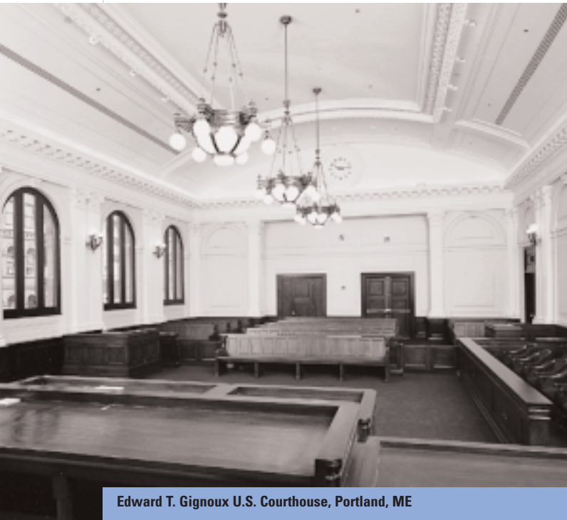
Edward T. Gignoux U.S. Courthouse, Portland, ME

To control noise during all modes of operation and for all load conditions, the HVAC system should be provided with one or more of the following: