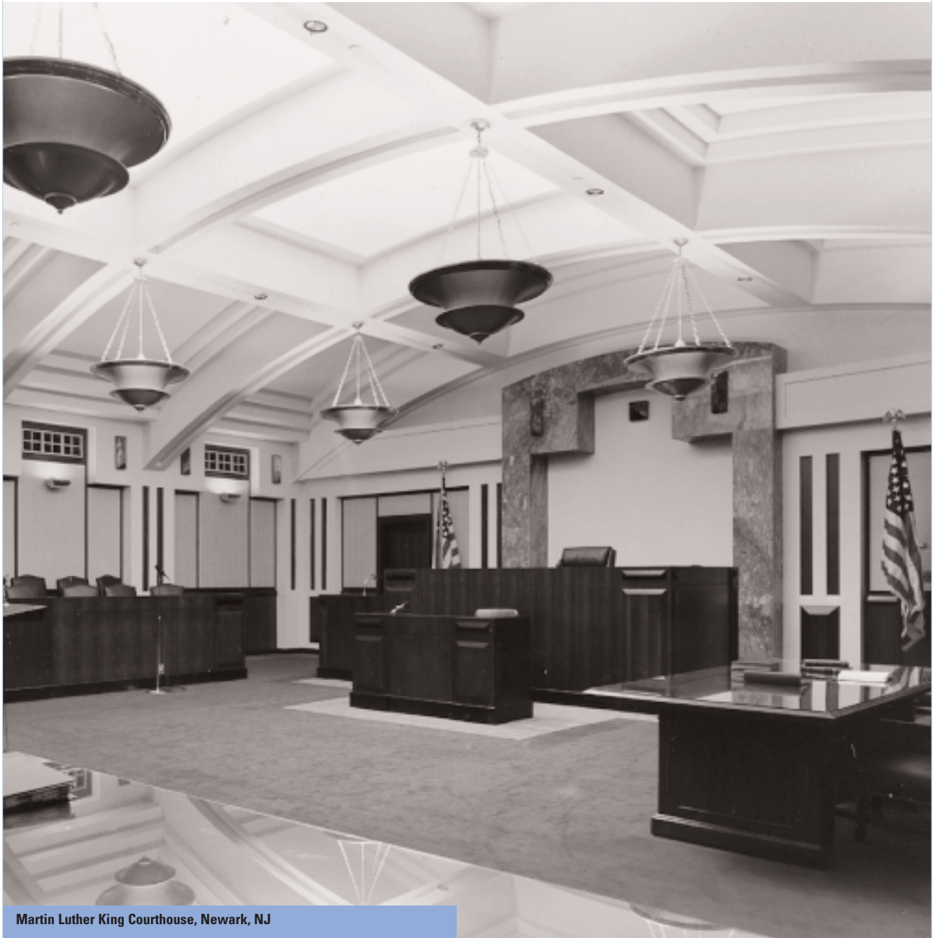
Martin Luther King Courthouse, Newark, NJ