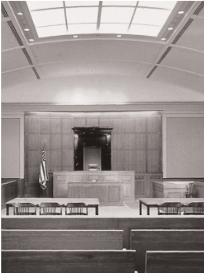
Harold D. Donohue Federal Building and U.S. Courthouse, Worcester, MA

Since U.S. Court facilities should be expected to have a long useful life, new construction and renovation projects need to be planned to provide adequate mechanical and electrical capability to the site and building(s) to support future additions. It is particularly important to design the systems for specialized areas of the building (lobby, food service, mechanical rooms, electrical rooms) to support