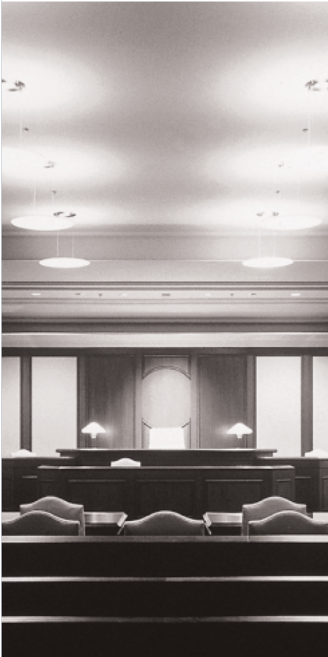
Robert C. Byrd Courthouse, Charleston, WV