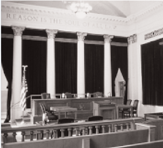
Byron White Courthouse, Denver, CO