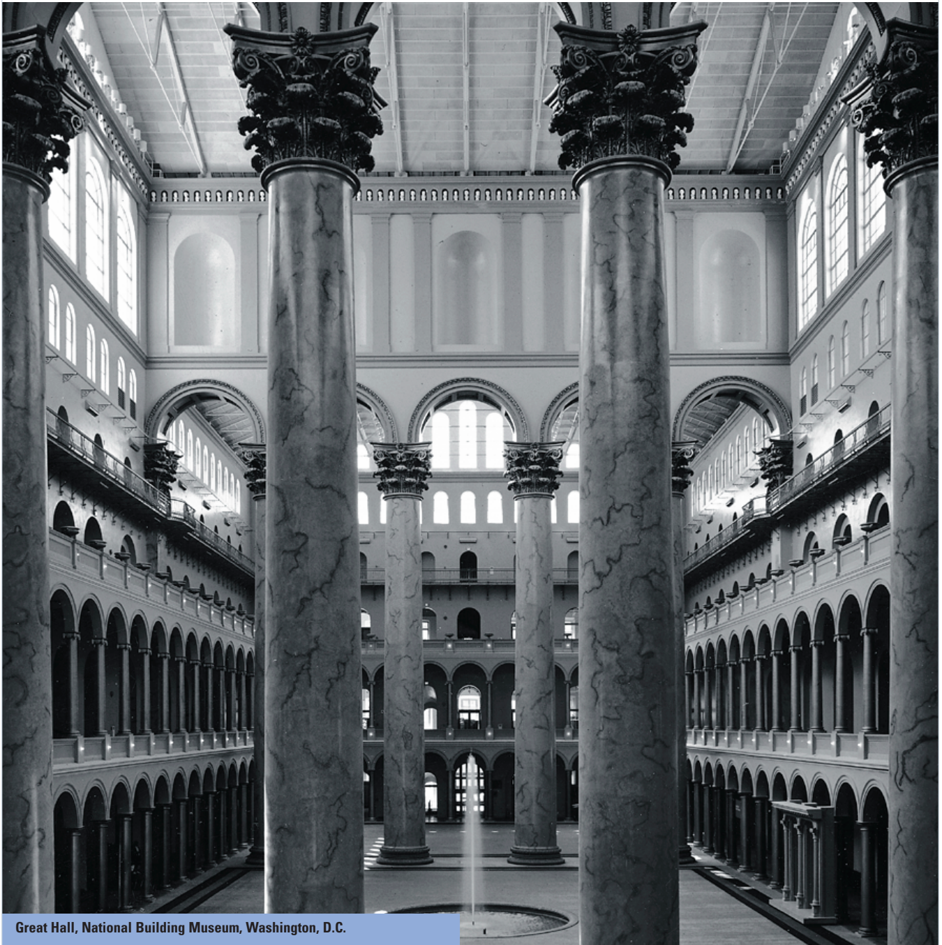
Great Hall, National Building Museum, Washington, D.C.