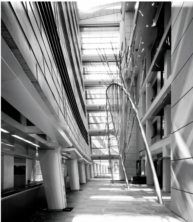
U.S. Courthouse, Seattle, Washington

Contrary to what is commonly believed, North America has year-round access to sufficient daylight for lighting