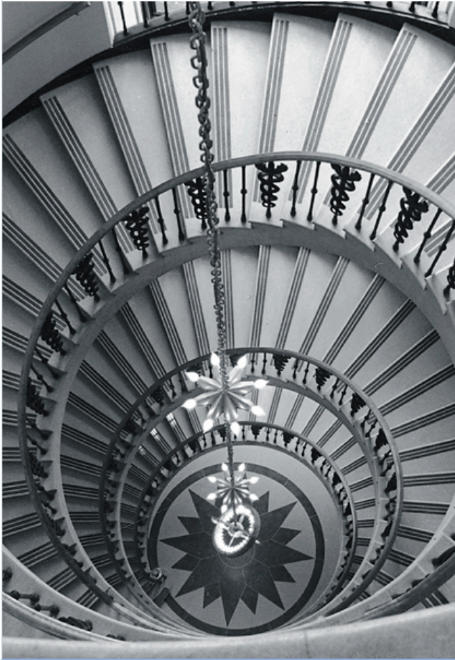
Historic stair, Ariel Rios, Washington, D.C.

Court buildings, border stations, and child care centers have special requirements for finishes. See the U.S. Courts Design Guide and Chapter 9: Design Standards for U.S. Court Facilities for Court spaces. See the U.S. Border Station Design Guide (PBS-P130), and GSA Child Care Center Design Guide (PBS-P140) for finishes for these facilities.