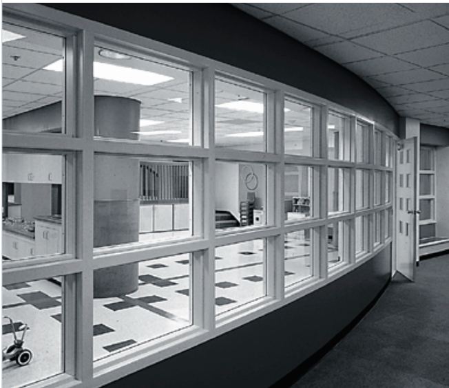
Robert A. Young Federal Building Child Care Center, St. Louis, MO

Child Care Centers. See GSA Child Care Center Design Guide (PBS-P140) . Child care centers will usually be operated by organizations outside the Federal Government. The GSA Office of Child Care Development Programs shall be consulted before design concepts are finalized.