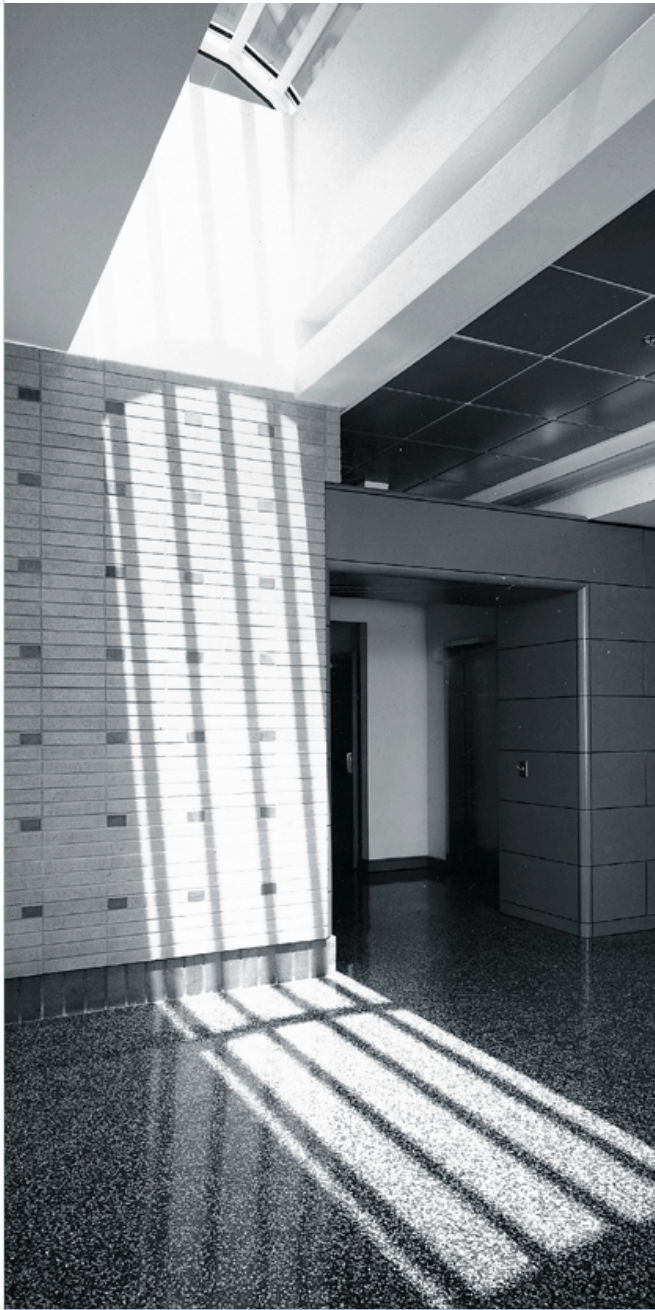
Vincent E. McKelvey Federal Building laboratory wing, Menlo Park, CA

Conveyance Systems. The selection and sizing of elevator and escalator systems must be performed as prescribed in the preceding section Selecting Conveyance Systems in this Chapter. No other life cycle cost analysis will be required for conveyance systems.