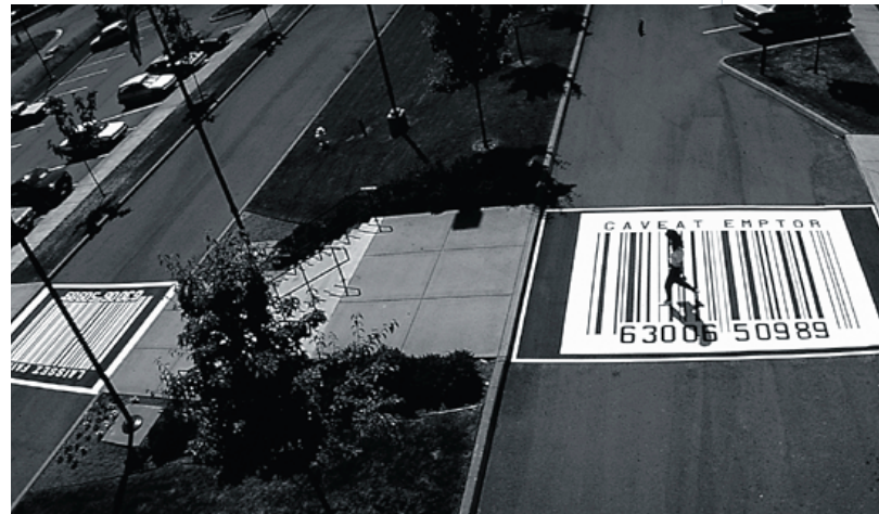
Food and Drug Administration District Headquarters

Parking Layout. To the extent possible, parking spaces should be arranged around the perimeter of the parking deck for maximum efficiency. Two-way drive aisles should be used with 90-degree vehicle parking stalls on each side. When locating entrances and ramps, consider internal and