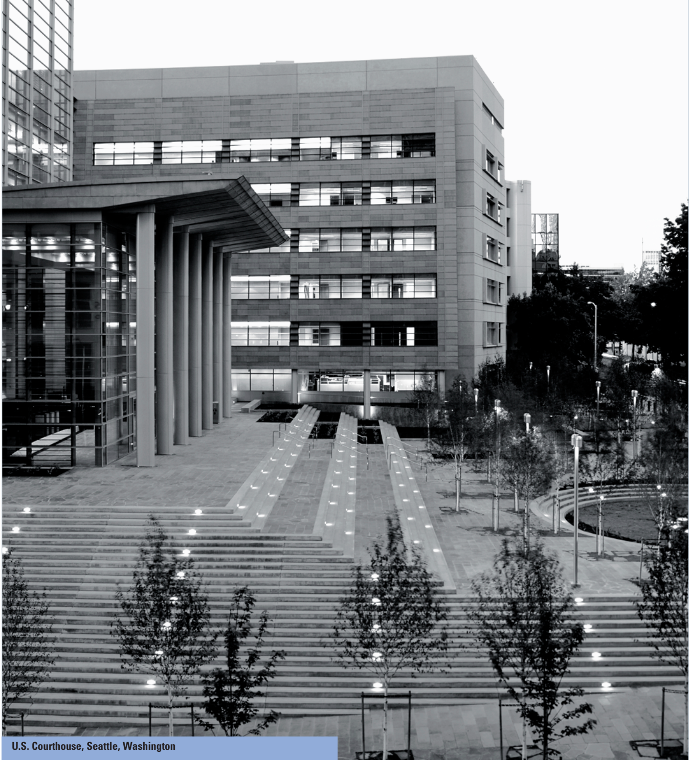
U.S. Courthouse, Seattle, Washington