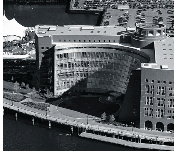
U.S. Courthouse, Boston, MA

Plazas should be designed with electrical outlets, and other simple infrastructure, to support future flexibility and a wide range of uses.