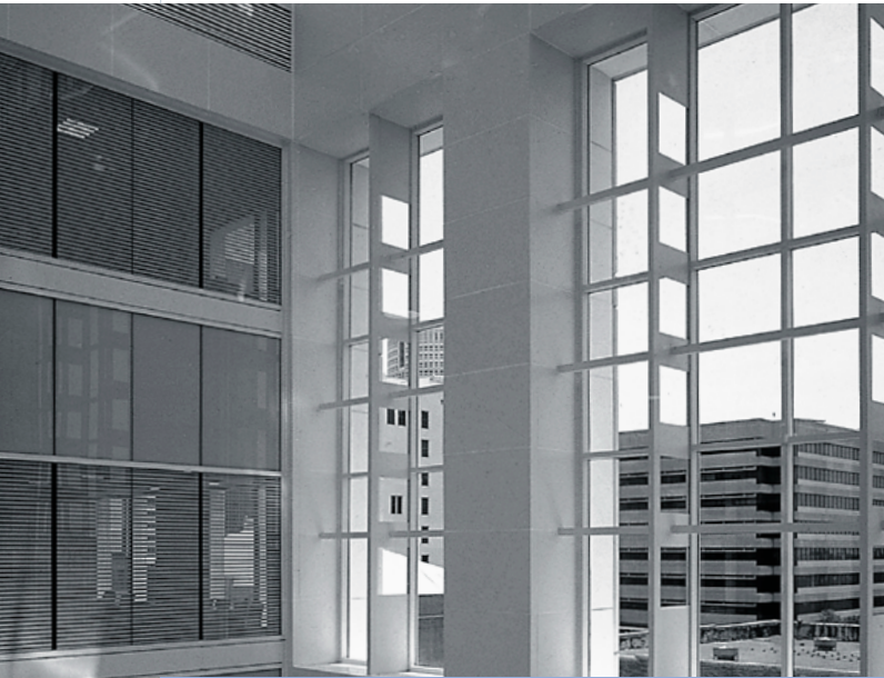
Sam Gibbons U.S. Courthouse, Tampa, FL

roosts” can create both maintenance and visual problems, particularly in high-rise buildings.