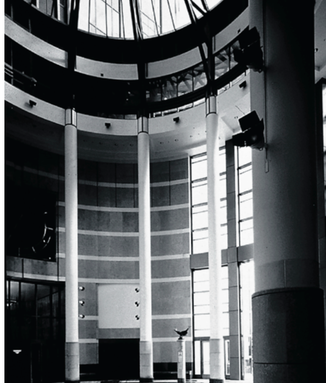
Oakland Federal Building, Oakland, CA

It is also equal to the sum of the basic rentable areas for that floor. Full floor tenants will be assessed the gross measured area of a floor minus building common spaces as their floor rentable area. Note that because it includes building common area, floor rentable area is not necessarily indicative of space demised for a single tenant's use.