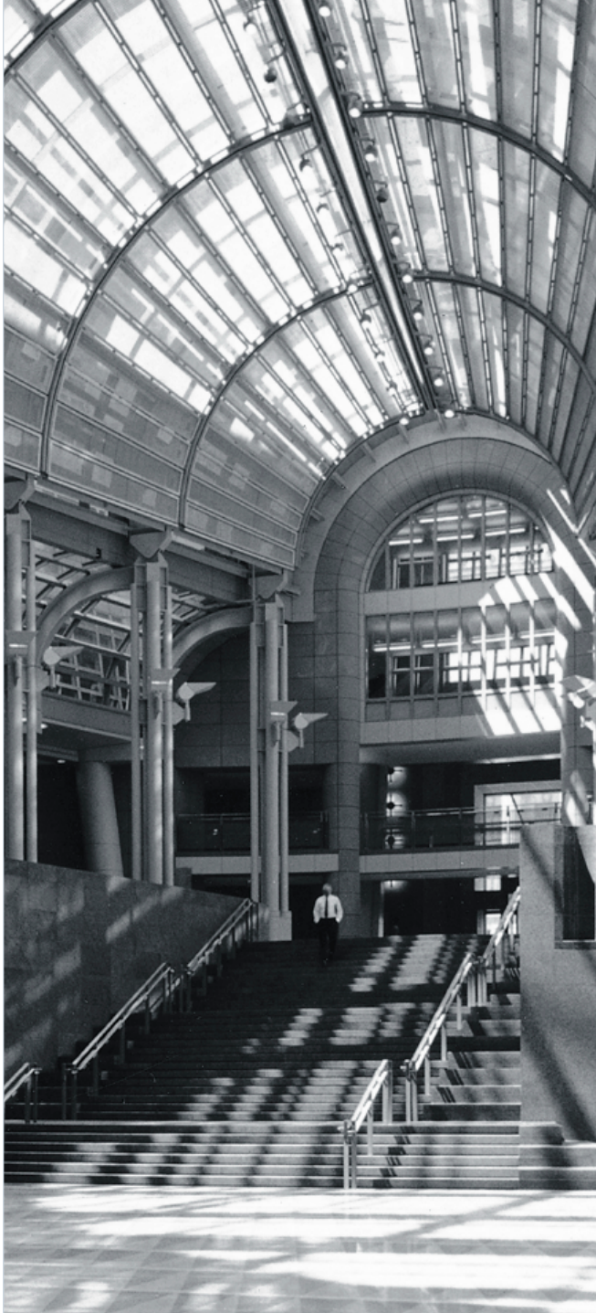
Reagan Building, Washington, D.C.

an air lock. The distance between inside and outside doors must comply with accessibility criteria.