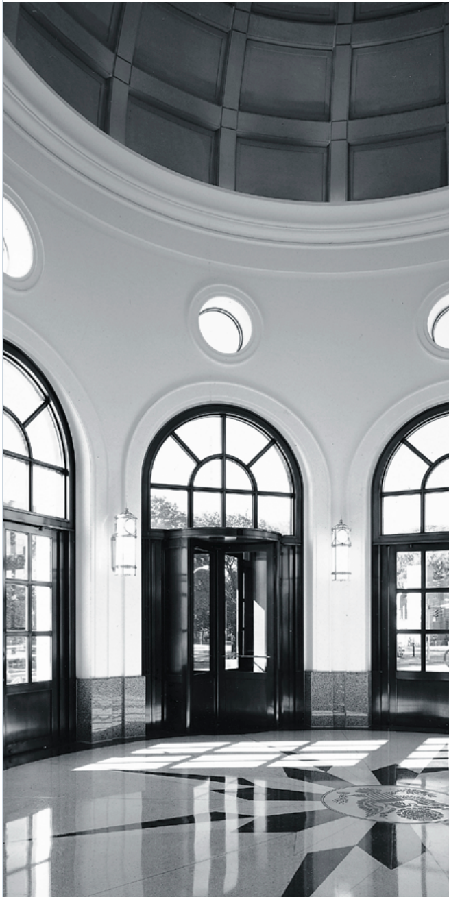
U.S. Courthouse, White Plains, NY