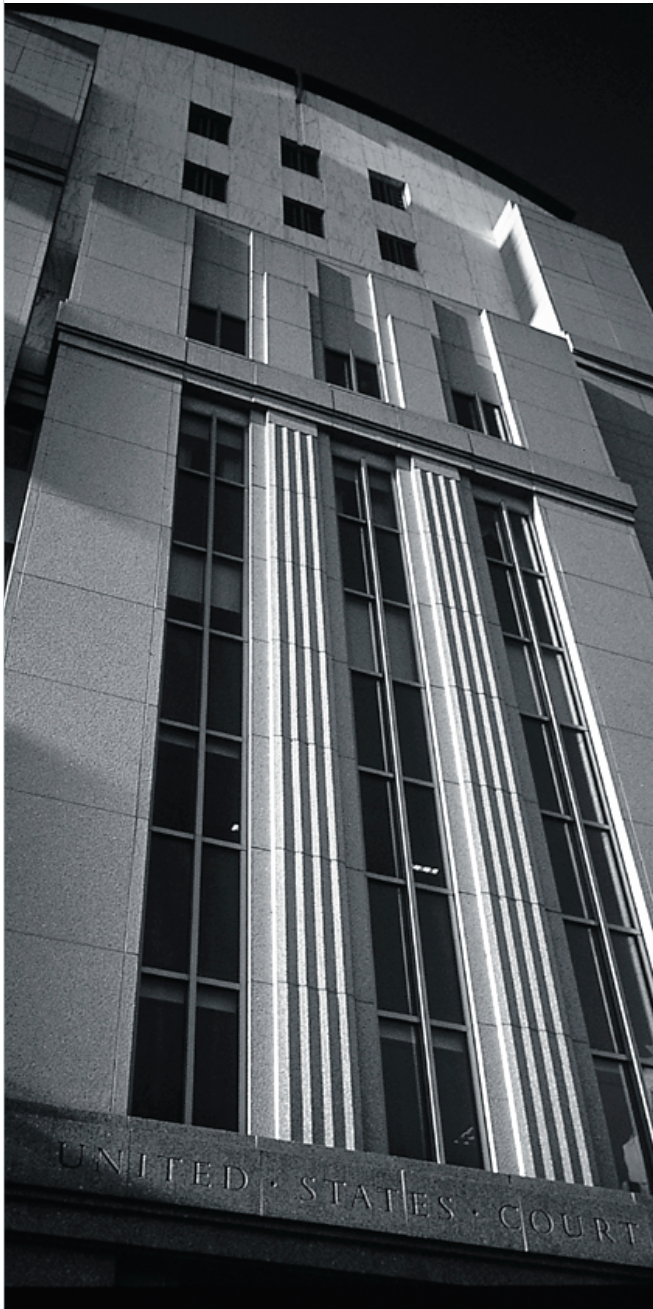
U.S. Courthouse at Foley Square, New York, NY

NIC 53 (teleconference room): double stud wall, two layers of gypsum board each side, batt insulation in the stud cavities. Full height (slab to slab).