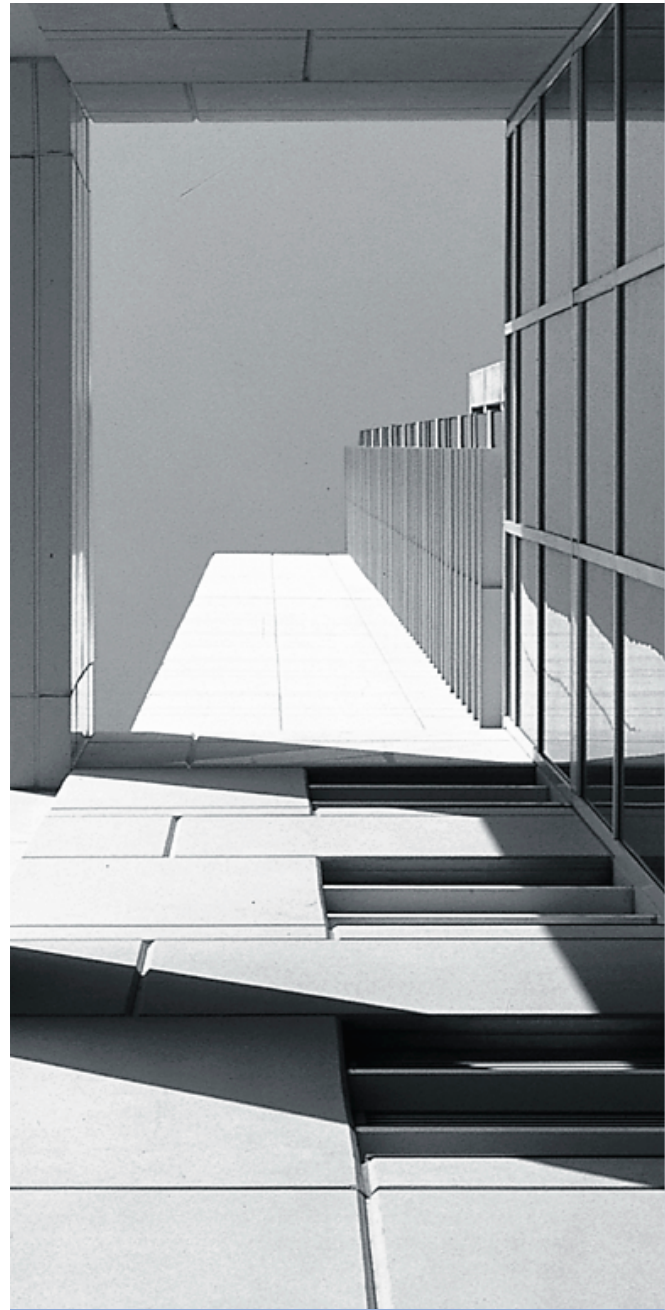
Sam Gibbons U.S. Courthouse, Tampa, FL

Alternative Roof Systems. In typical projects, a life cycle cost analysis is not required. If a new technology is proposed that has a higher initial costs and probable long term cost savings, then an analysis should be used as part of the decision to utilize the new technology.