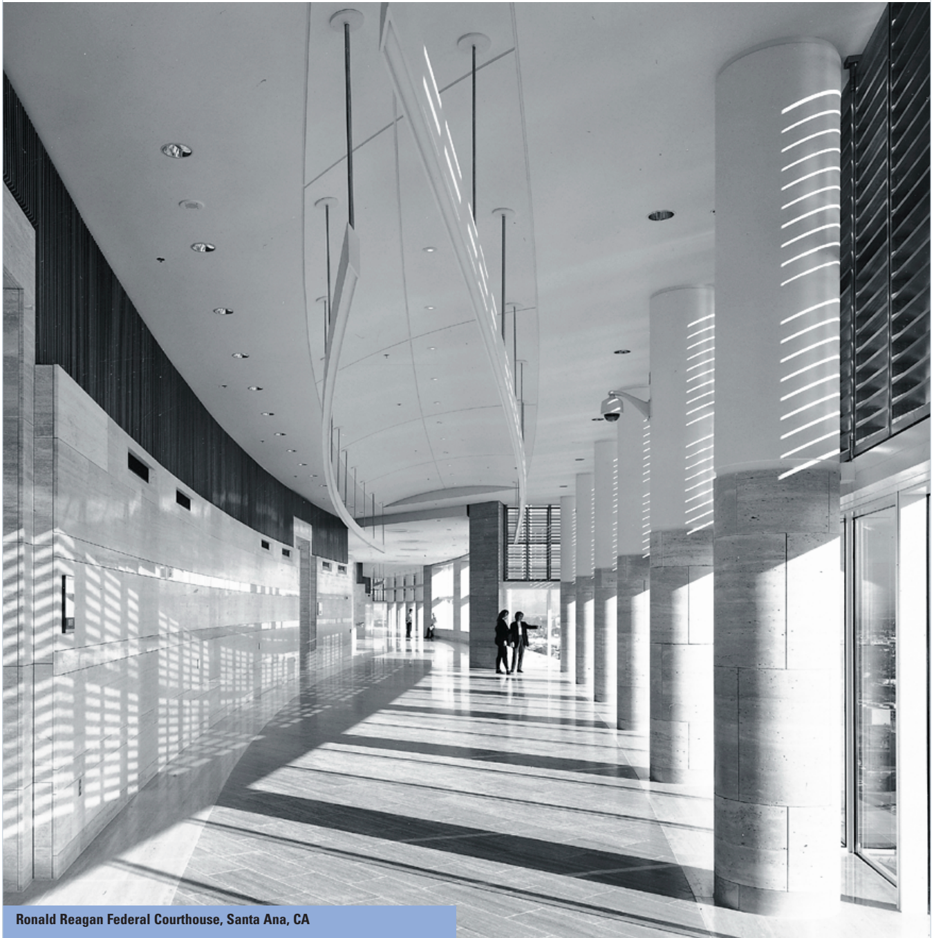
Ronald Reagan Federal Courthouse, Santa Ana, CA