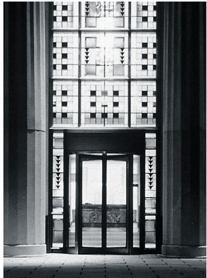
Robert C. Byrd Courthouse, Charleston, WV

Window cleaning. The design of the building must include provisions for cleaning the interior and exterior surfaces of all windows. Window washing systems used in the region must be considered and a preferred system and equipment identified during design. In large and/or high-rise buildings, such glass surfaces as atrium walls and skylight, sloped glazing, pavilion structures, and windows at intermediate design surfaces must be addressed. See also the Building Specialties, Window Washing Equipment section of this chapter.