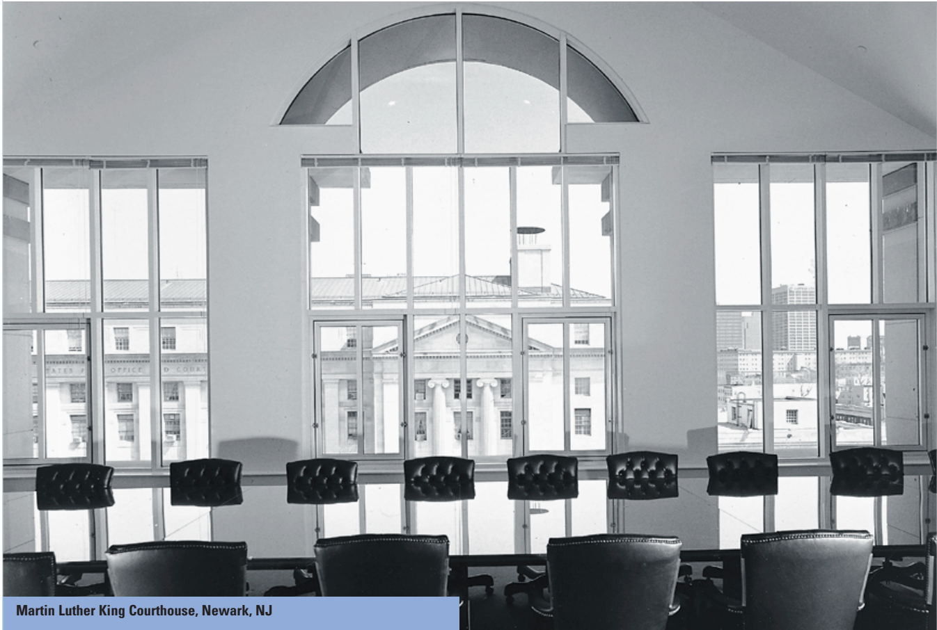
Martin Luther King Courthouse, Newark, NJ

Architectural Woodwork. Work under this section should be certified as meeting the referenced standard under the terms and conditions of the AWI Quality Certification Program.