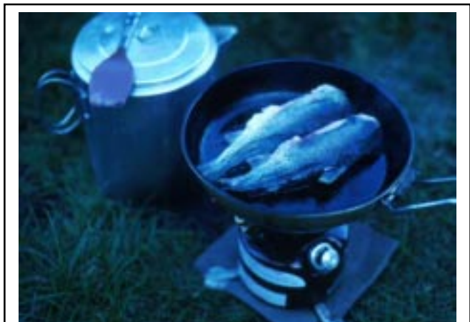
Stoves only at Upper Lena Lake in the National Park.