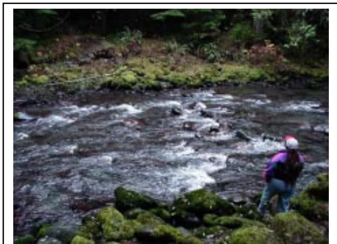
Gray Wolf River.

TRAIL INFORMATION: Trail is 3.1 miles in length with grades from 0 to 30%. The first segment of the trail is flat. Then it drops steeply, descending to canyon floor and the Gray Wolf River. NOTE: The washed out foot-log has been replacee with new bridge across Gray Wolf River. Stock users should use extreme caution when fording river with stock. NOTE: Obtain Park Wilderness Permit for overnight trips into Park.