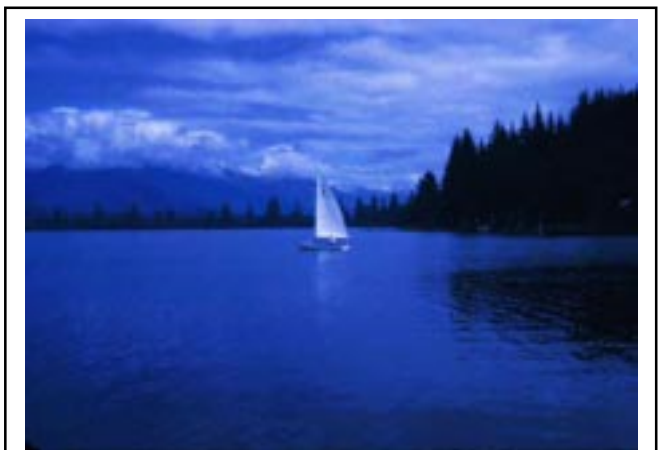
The Quinault National Recreation Trail #854 follows the south shore of Quinault Lake for 1.3 miles.

TOPO MAP: Quinault-Colonel Bob Custom Correct Map. Free trail map available at Forest Service Quinault office.