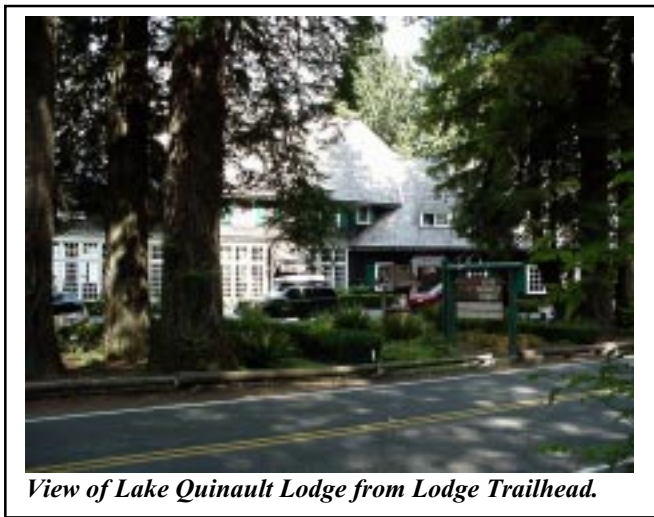
View of Lake Quinault Lodge from Lodge Trailhead.

TRAIL INFORMATION: The Lodge Trail provides access primarily for guests staying at the Lake Quinault Lodge to hike the Quinault National Recreation Trail #854. The Lodge Trail begins across from the Lodge entrance. The trail is only 0.6 mile in length. The Lodge Trail junctions with the Quinault National Recreation Trail. The Lodge Trails provides a short hike to see the rain forest and is a good short hike for children. The Quinault National Recreation Trail provides a 4-mile loop hike through the rain forest and along the south shore Quinault Lake before returning to the Lodge.