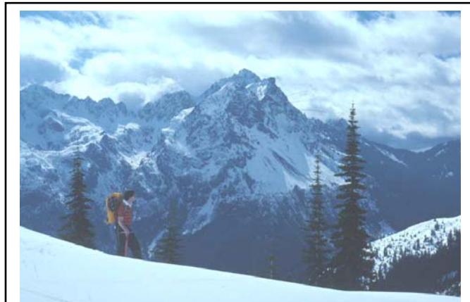
Winter view of Mt. Pershing from snow covered Putvin Trail #813.

TRAIL INFORMATION: This trail is very steep and difficult in places. There are a few campsites scattered along the trail. Once Lake of the Angels is reached, one can find numerous way-trails and paths leading in many different directions. One scramble trail takes the hiker onto the East slope of Mt. Skokomish; a second climbs the northwest end of the canyon to higher alpine areas. Overnighters traveling into the Olympic National Park will need to fill out a wilderness permit (located along trail at 1.3 miles).