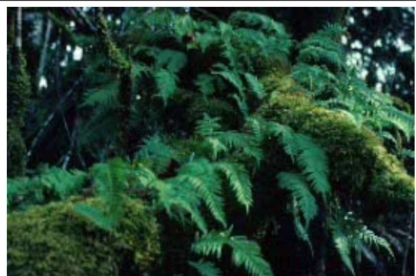
Lush rain forest vegetation can be seen along Pete's Creek Trail #858.

TOPO MAP: Quinault-Colonel Bob Custom Correct Map or Quinault Lake USGS Quad.