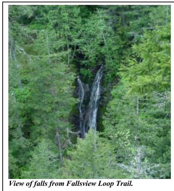
View of falls from Fallsview Loop Trail.