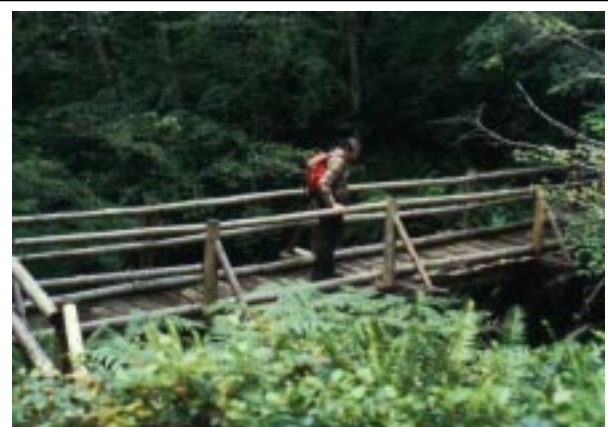
A hiker enjoys view of Big Creek from one of two trail bridges along the trail.

PASS REQUIRED: A NW Forest Pass or a Golden Passport (Eagle, Age or Access) is required on each vehicle parked at trailhead. Day & Annual NW Passes are available at FS offices and vendors, but not at trailheads.