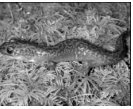
A Cope's giant salamander is an important predator in headwater streams.

Responses of birds to forest conditions along streams were also highly variable.