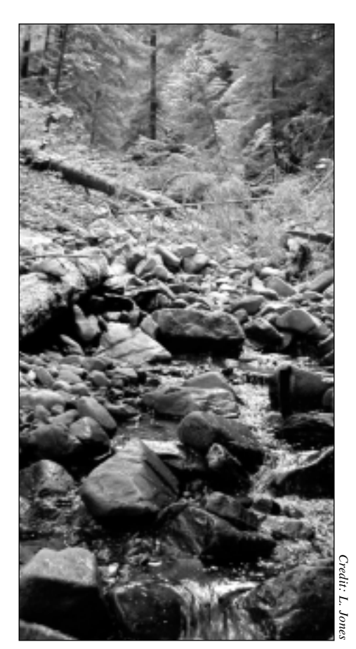
Small steep streams make up the majority of the drainage network in Olympic Peninsula watersheds.

The size of the buffers, determined during the forest ecosystem management assessment process in 1993, was determined from a thorough review of existing literature, he says. But few field data were available comparing the efficacy of alter-