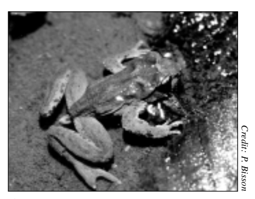
Tailed frogs inhabit headwater streams and are sensitive to changes in riparian forests.

Other parameters affecting the local abundance of fishes in these headwater streams included elevation of the watershed, gradient of the channel, and the amount of primary production—aquatic plant production controlled by light and nutrients. Headwater streams on the Olympic Peninsula are typically disturbance prone, Bisson explains, as this was reflected by the variability in fish populations from site to site.