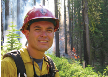
The Faces of Firefighting

There are many different specializations in the NPS Fire Management Program, some of which require special skills and training, and all of which require enthusiasm and dedication. This is a competitive arena which places physical and mental demands on employees.