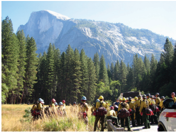
Fire management can be an exciting, rewarding career in the National Park Service with many opportunities.

GIS Specialist: Uses satellite technology to map fire perimeters, vegetation areas, and other scientific studies.