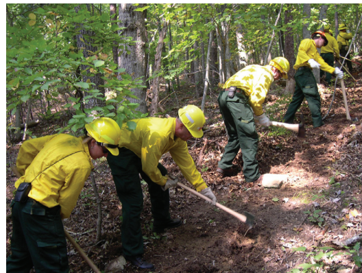
Handcrew members use specialized firefighting tools, including the pulaski.

Firefighter: Serves as a crewmember on a handcrew, using a variety of specialized tools, equipment, and techniques on wildland and prescribed fires. Job announcements for firefighter positions may be titled as Forestry Technician or Range Technician.