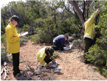
Biological technicians and fire effects monitors collect data from burned and unburned areas.