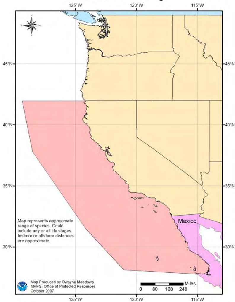
Figure 1. Range of the southern bocaccio population that is the species of concern.