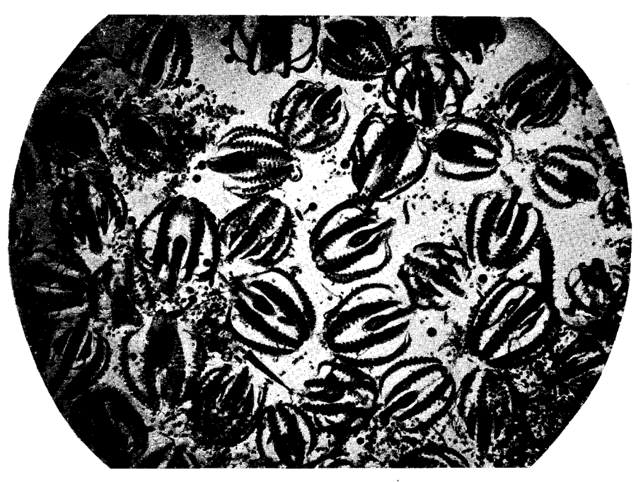
Fig. 18.—Plankton dominated by the ctenophore Pleurobrachia pileus , with barnacle (Balanus) larvae in the "nauplius" stage. Browns Bank, April 16, 1920, haul from 40-0 meters (station 20106). X 1.5