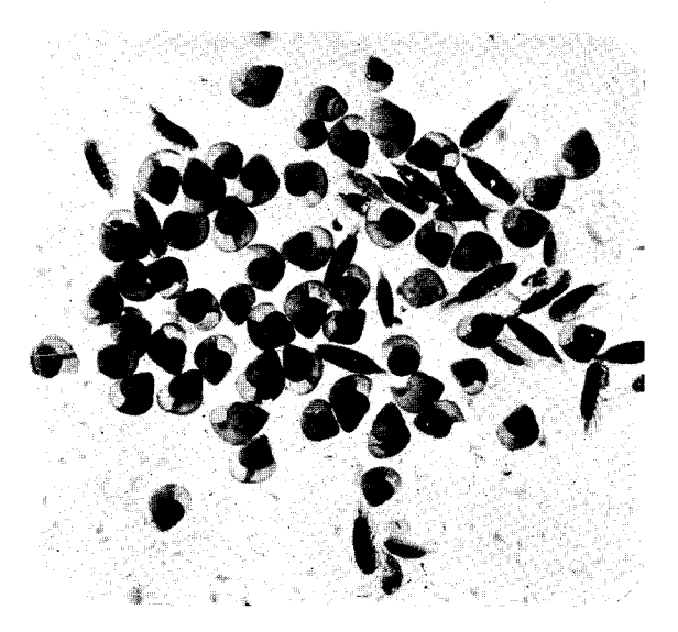
FIG. 17.—Pteropods ( Limacina retroversa ) and Calanus fin marchicus , northwest part of Georges Bank, July 20, 1914, haul from 50-0 meters (station 10215). × about 2.5