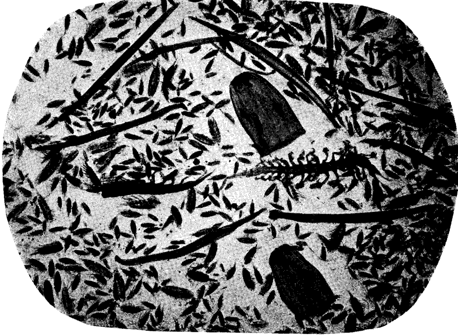
FIG. 10.—Calanus community, chiefly Calanus finmarchicus , with C. hyperboreus , Euchata norvegica , Sagitta elegans , Tomopteris, Thysanoessa, and Aglantha. Western side of basin, March 24, 1920, haul from 203-0 meters (station 20087). \times 1.5