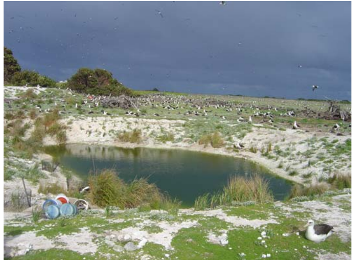
April 2005. Native plants begin to take hold.