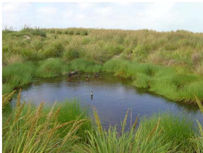
October 2006. Restoration Complete. Native plants mature and reintroduced and fledged Laysan Ducks present.