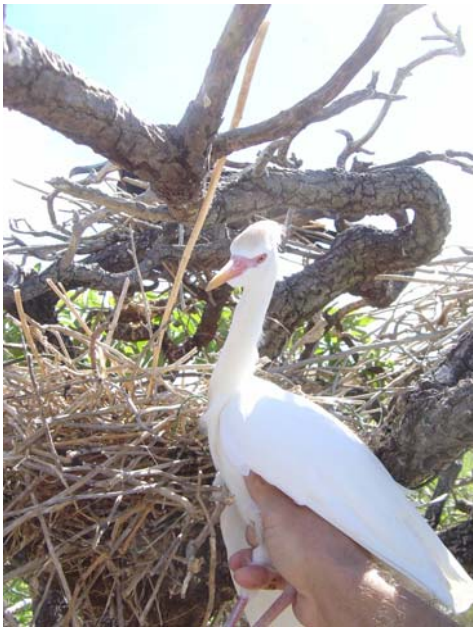
April 2005. Nonnative cattle egret nesting is eliminated.