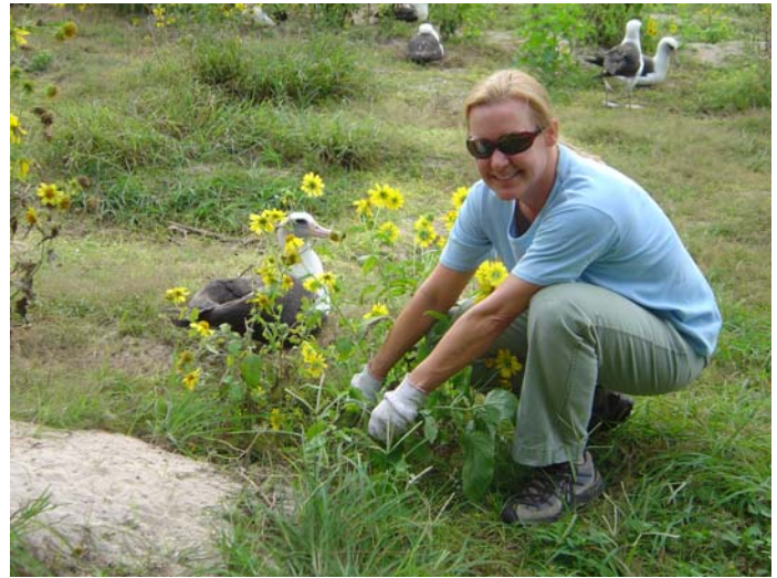
July – August 2004 Verbesina hand-pulled.