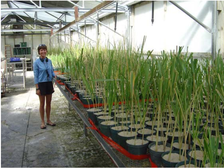
September 2004. Native Bunch Grass & others grown in greenhouse.