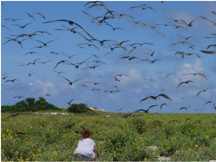
July 2004. Invasive plant Verbesina encelioides throughout area.