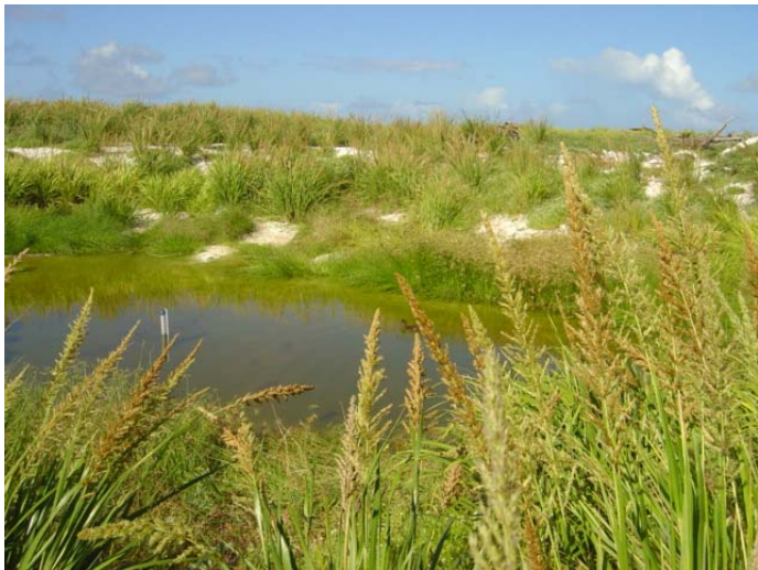
October 2005. Native plants growing. 16 Laysan Ducks released.