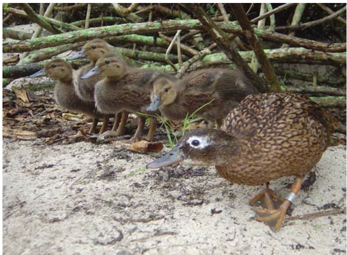
Spring/Summer 2006. Laysan Ducks nest on Eastern Island.