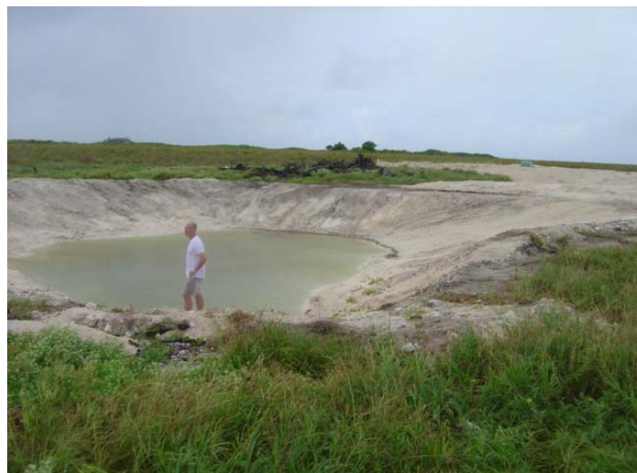
November 2004. 60 hours digging with backhoe. Water 3 ft deep.