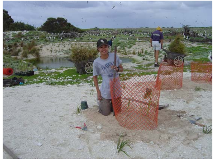
March 2005. Native grass and sedge planted and fenced.