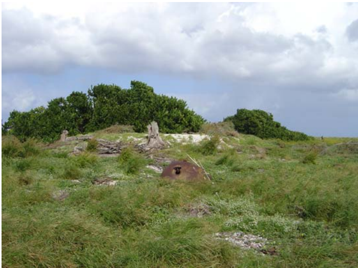
September 2004. Verbesina cleared and piled.