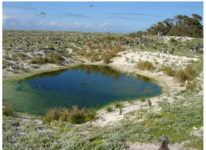
April 2005. Migratory scaup using wetland. Plants growing.