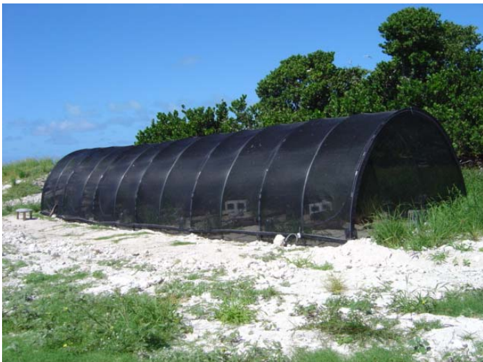
August 2005. Laysan Duck aviary constructed.