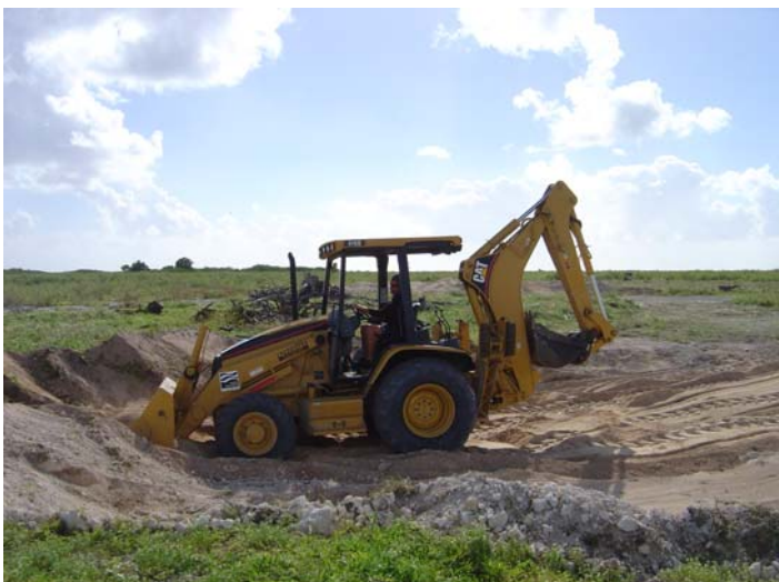
October 2004. Backhoe digs 10 ft down into freshwater lens.