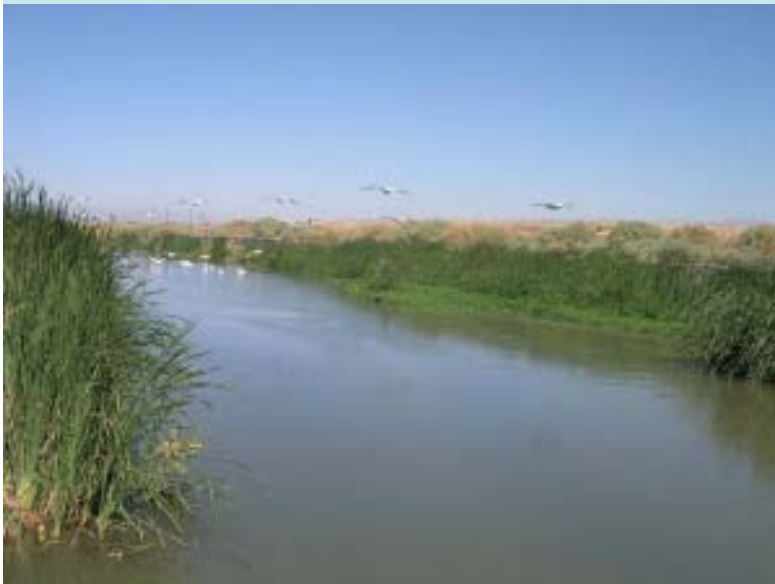
Salton Sea Wetlands